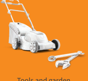
Tools and garden equipment

Appliances e.g. microwaves, fridges, dryers, vacuum cleaners, washing machines, kettles, jugs, pots and pans