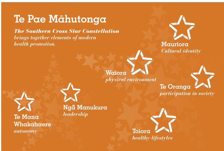
Figure 3. Te Pae Māhutonga brings together elements of modern health promotion

Tools to Support a Health in All Policies Approach gives further information on Te Pae Māhutonga and other Māori models of health. (See the References and Resources section.)