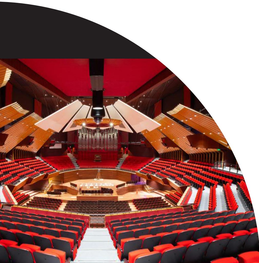
Douglas Lilburn Auditorium, Christchurch Town Hall, 2019

This strategy has been developed to move the city towards its goal of being known as the best place in New Zealand to live and create, and to explore and experience art. After five years it will be reviewed and updated to ensure it continues to deliver for the sector, for communities, and for the city and Banks Peninsula.