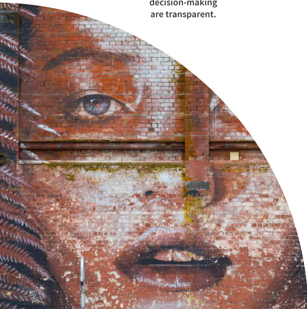
Street Art, Rone, Worcester Blvd, Rise Festival 2014

We will seek to work collaboratively, support one another, communicate clearly and challenge respectfully.