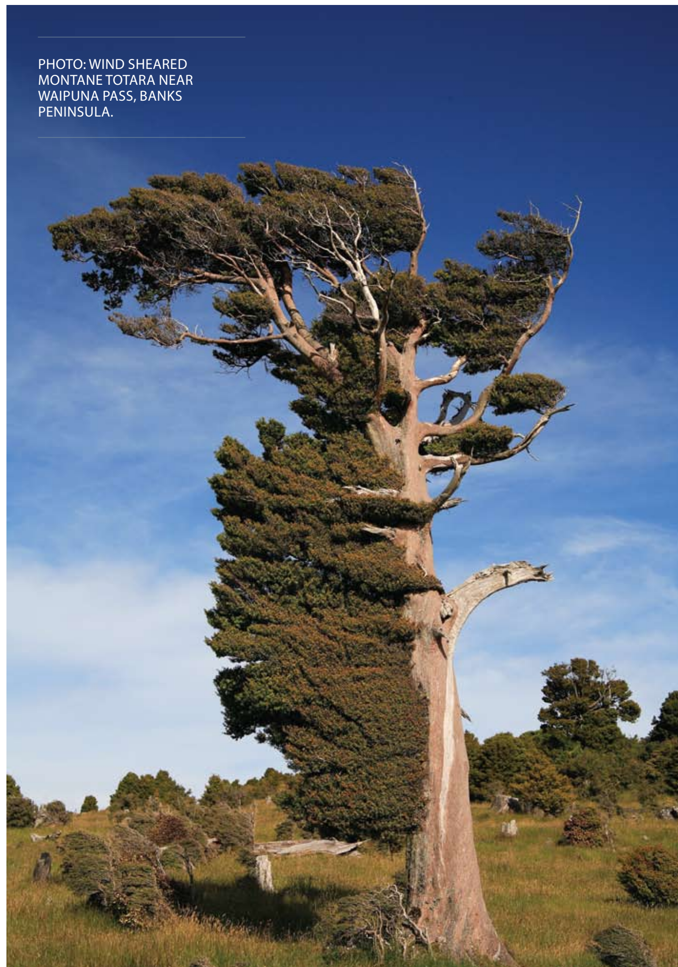
PHOTO: WIND SHEARED MONTANE TOTARA NEAR WAIPUNA PASS, BANKS PENINSULA.