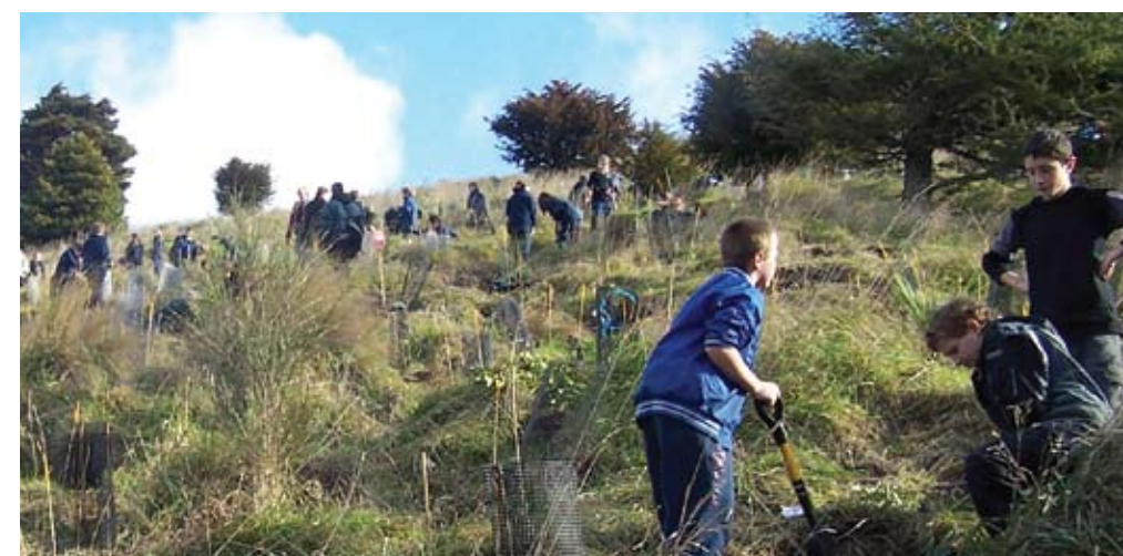
PHOTO: SUMMIT ROAD SOCIETY PLANTING DAY, PORT HILLS.