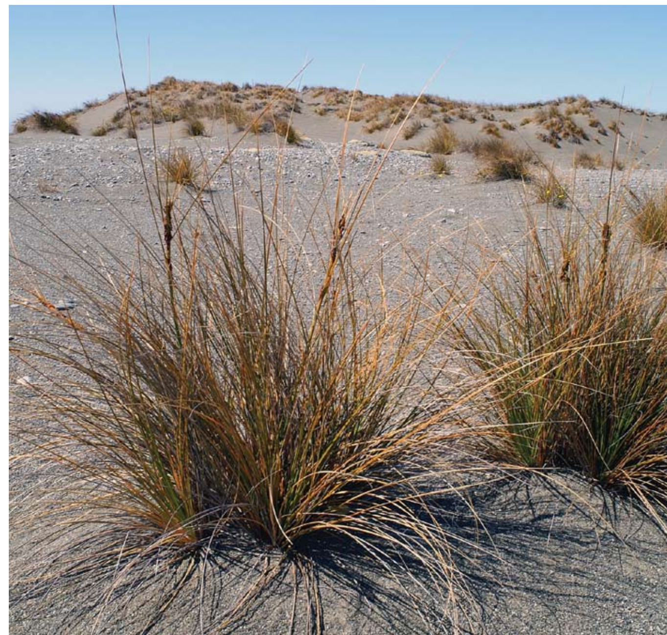
PHOTO: THE LARGEST NATIONAL POPULATION OF PĪNGAO COVERS COASTAL DUNES ON KAITORETE SPIT.