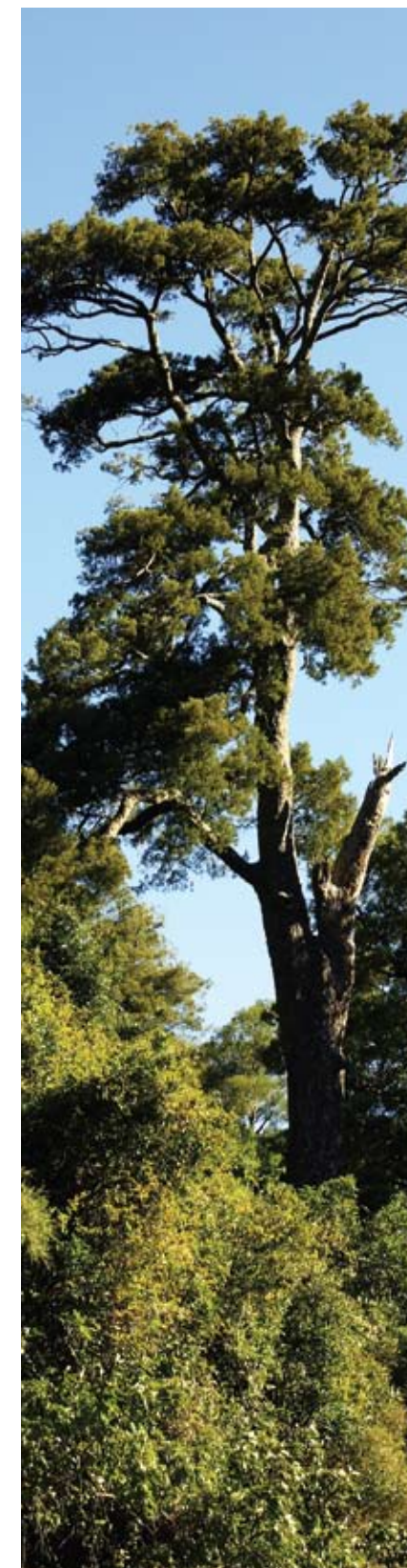
PHOTO: EMERGENT PODOCARP IN A LOWLAND FOREST PATCH PROTECTED BY A QE II NATIONAL TRUST COVENANT.