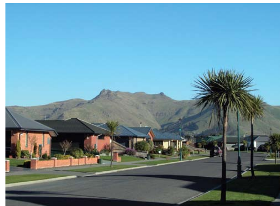
PHOTO: THE PORT HILLS PROVIDE AN OUTSTANDING NATURAL LANDSCAPE BACKDROP TO CHRISTCHURCH.