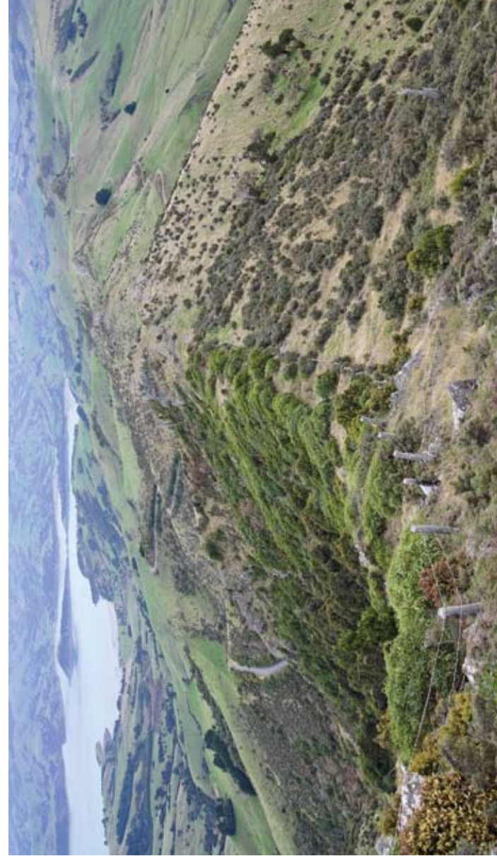
PHOTO: GRAZING LEVELS, FENCES AND ASPECT INFLUENCE PLANT COVER; BANKS PENINSULA.