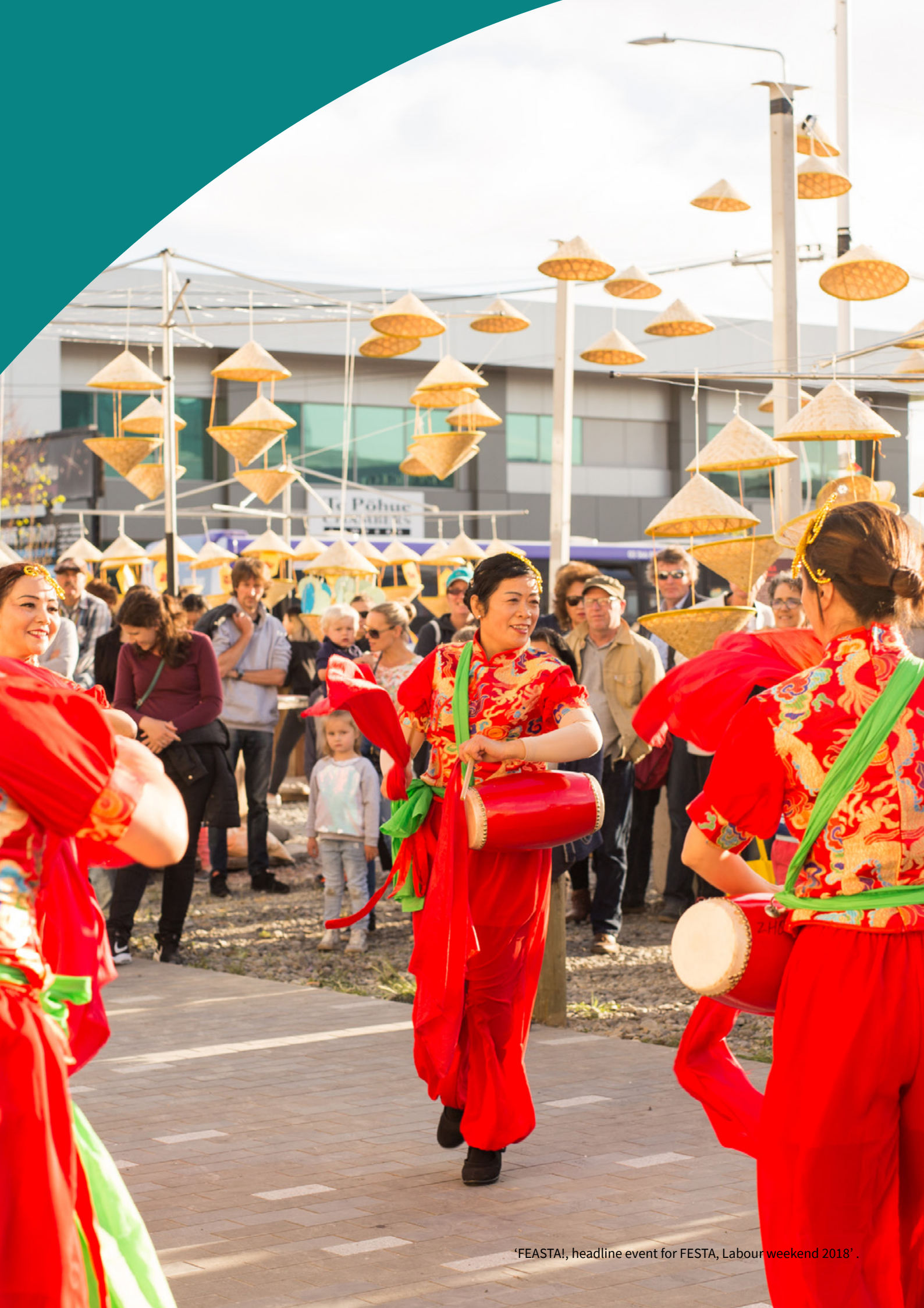
'FEASTA!, headline event for FESTA, Labour weekend 2018'.