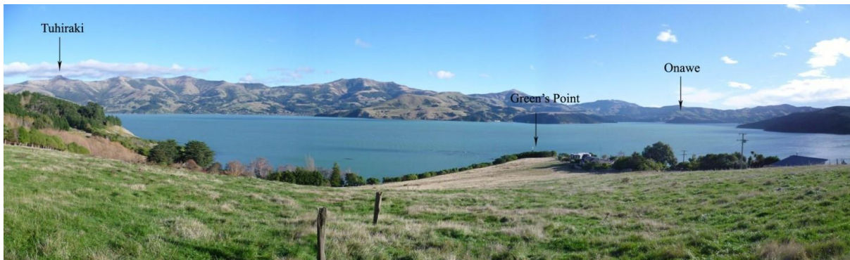
Takapūneke Reserve - Some of the Key Viewing areas from the top of the reserve adjacent to Onuku Road looking across the Akaroa harbour (refer 5.5 Viewing Areas below)