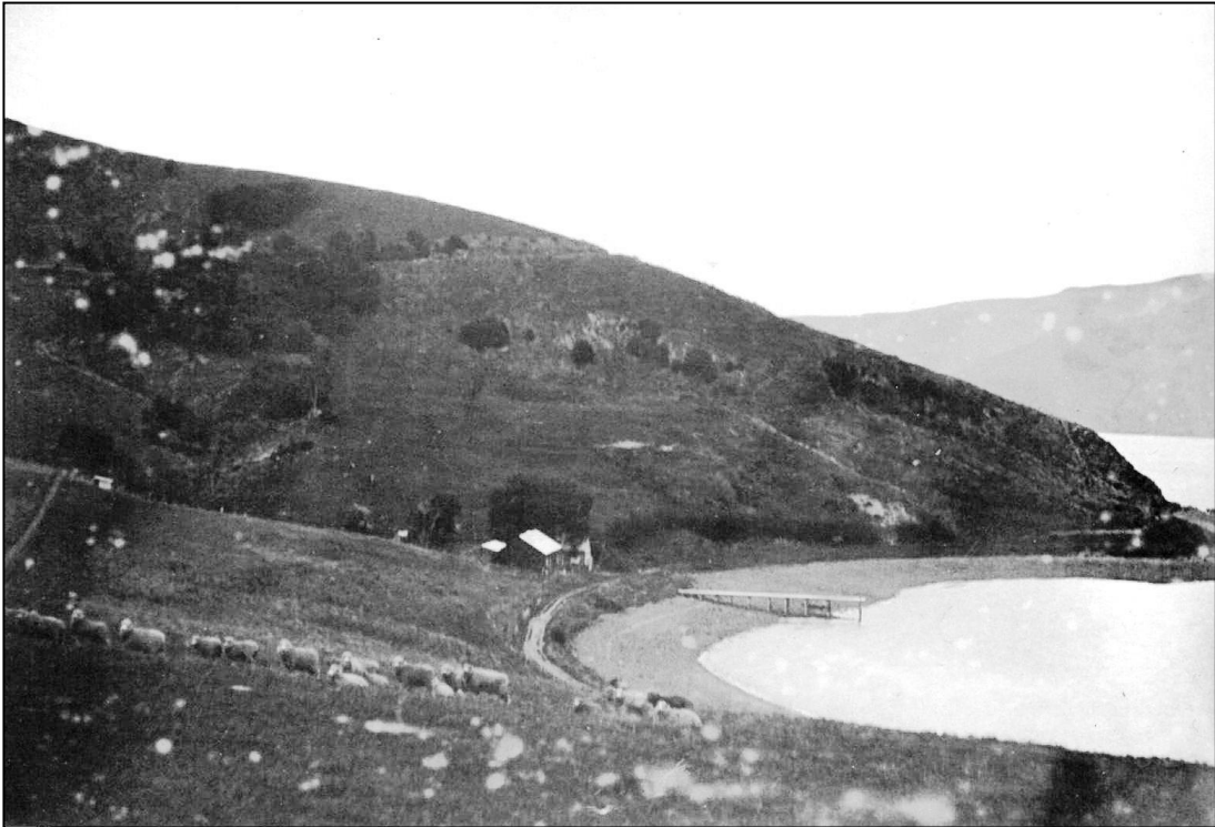
Red House Bay c1900. The barracks is visible in the centre of the photograph. (Photograph by Jan Shuttleworth, from Takapūneke and Green's Point, Akaroa Civic Trust, 2010).