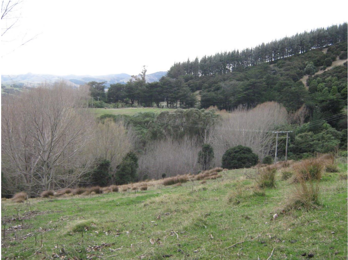
Takapūneke Reserve – Looking from Te Wahi Ao o Takapūneke to the flat capped area of the landfill site, proposed for a car park. Electricity power cables crossing the reserve.