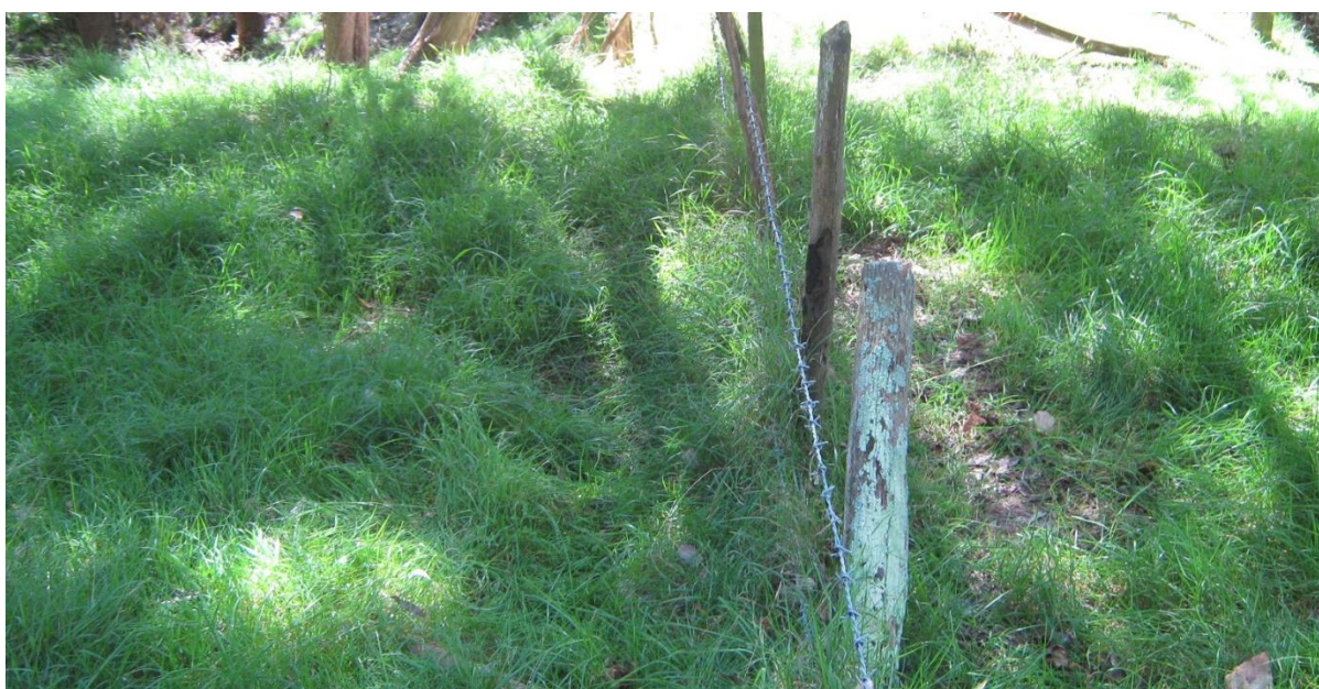
Takapūneke Reserve - Totara fence posts – part of the historic fabric of the reserve.

To some of the residents and visitors to Takapūneke Reserve the Objectives and Policies may seem unnecessary, or very restrictive on the activities permitted on the reserve. The reason these activities are discouraged or not permitted is out of respect for the past atrocities that occurred on this site and in recognition and acknowledgement of the cultural heritage and wāhi tapu status of the reserve.