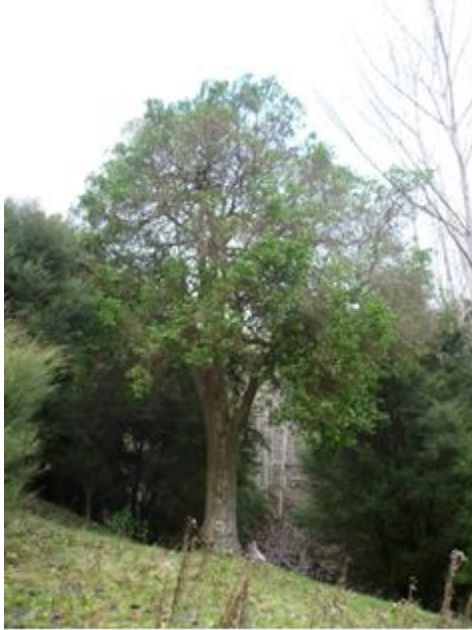
Turepo Streblus heterophyllus may be the only pre-European tree remaining at Takapūneke Reserve