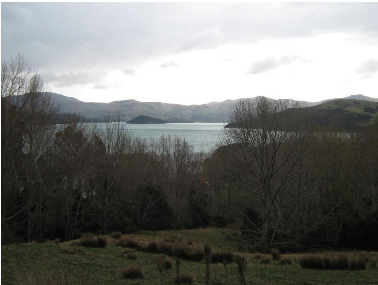
Takapūneke Reserve – looking from Te Wahi Ao o Takapūneke towards Ōnawe – Views to be retained.