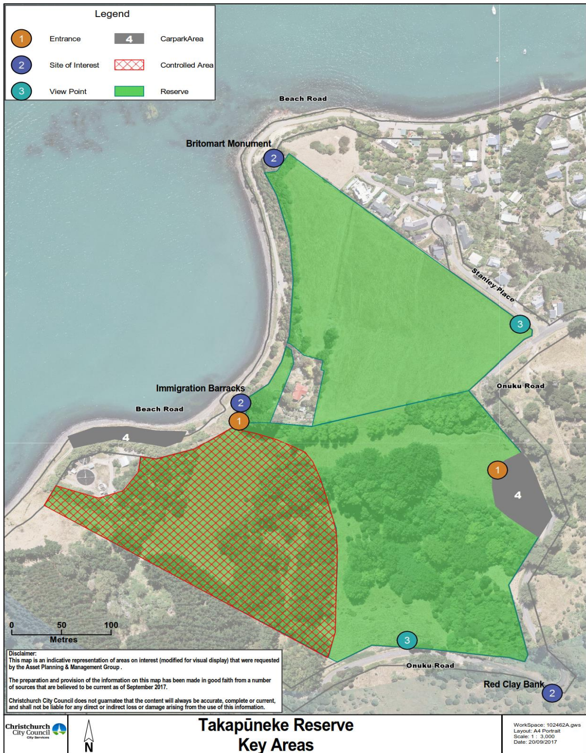
Figure 2. Reserve map