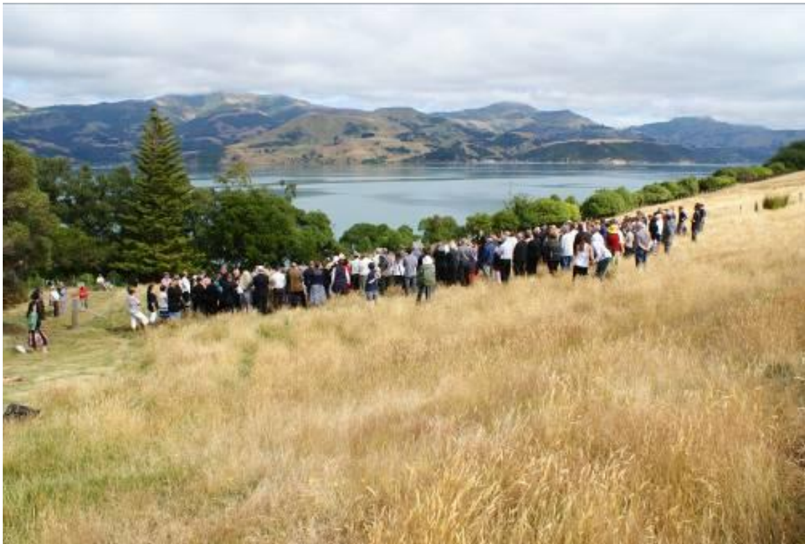
Guests gathered for the formal blessing ceremony at Takapūneke Historic Reserve, 5 February 2010.