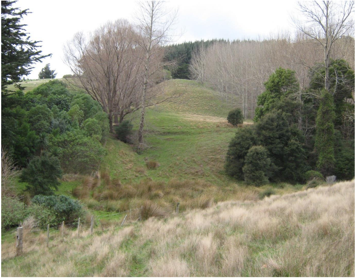
Takapūneke Reserve looking from Beach Road up the hill towards the capped landfill site where the (top) car park is proposed. A path with steps are proposed from Beach Road to the top car park.