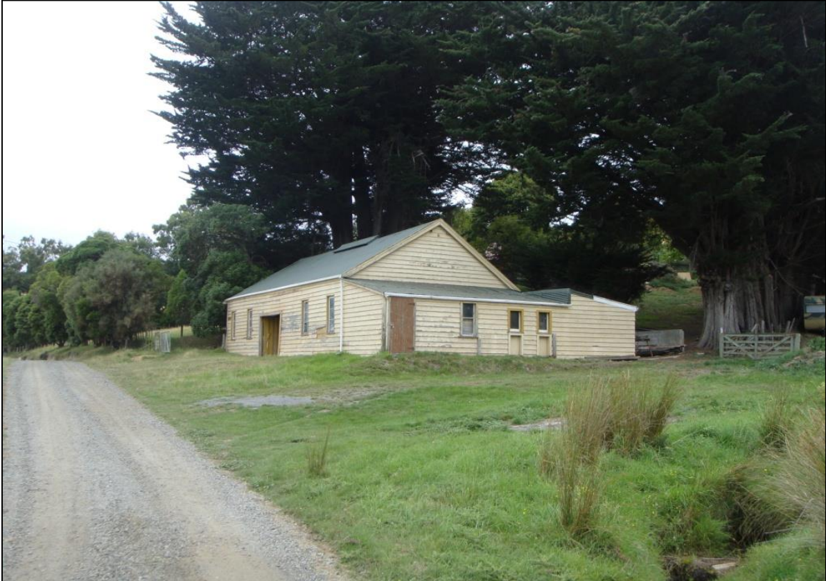
Immigration Barracks next to Beach Road