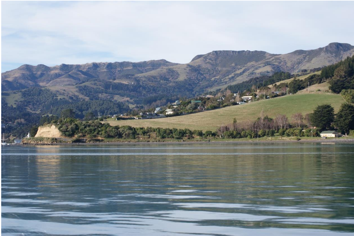
Takapūneke Reserve looking towards the east with the Immigration Barracks towards the waters edge and Ōnuku Road on the right. Location map – Takapūneke reserve, banks peninsula