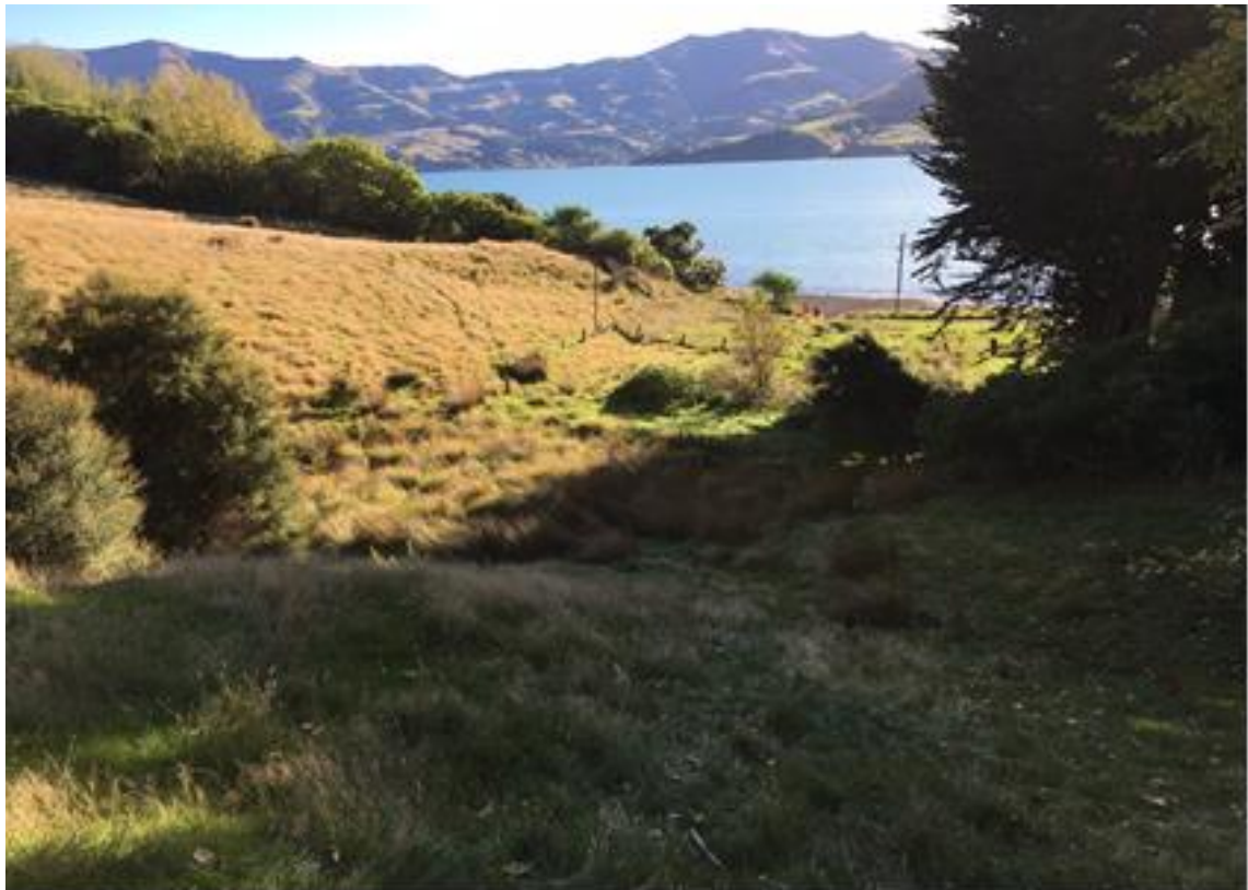
Takapūneke Reserve – Looking from Te Wahi Ao o Takapūneke towards Beach Road and Akaroa harbour.

The cultural, social, heritage, landscape and archaeological values of Takapūneke Reserve are recognised, protected and enhanced through the integrated co-governance of the reserve by Ōnuku Rūnanga and Christchurch City Council for future generations.