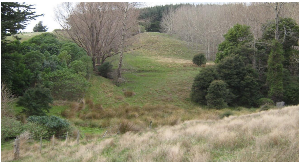
Takapūneke Reserve - Looking from Beach Road across Te Wahi Ao o Takapūneke, between the trees to the capped knoll of the landfill site – proposed area for the central path (refer below to section 5.11 Access and Paths, Policy 2. i.)