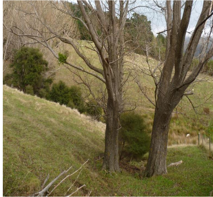
Green mistletoe Ileostylus micranthus on a willow branch at Takapūneke Reserve