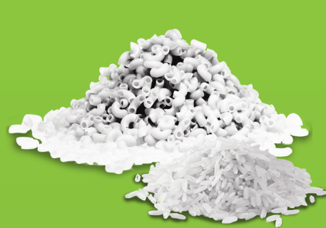
Grains, pasta and rice