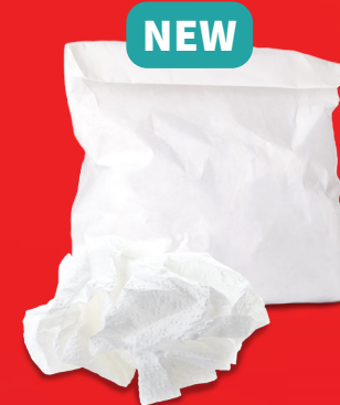
Paper towels and takeaway bags