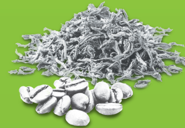
Loose tea leaves and coffee grounds