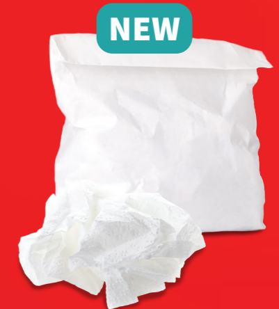
Paper towels and takeaway bags