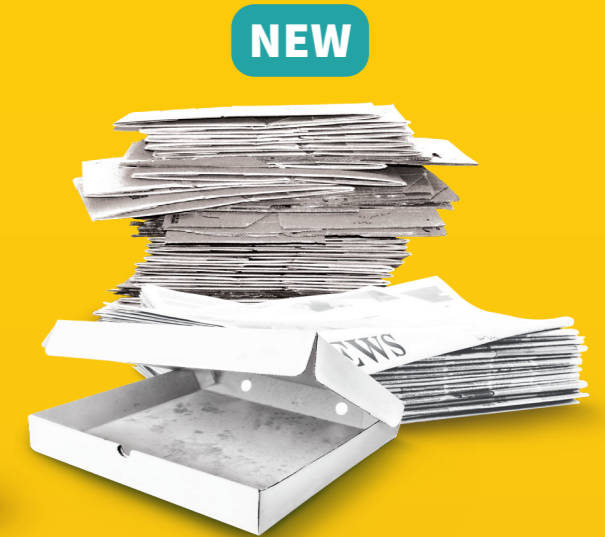
Clean cardboard and paper (including empty pizza boxes)