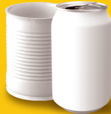
Clean food and drink tins and cans (loose lids in the red bin)