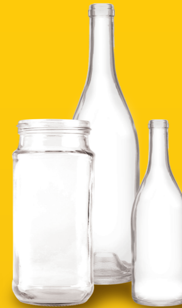
Clear and coloured glass bottles