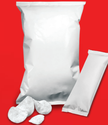
Soft plastics e.g. chip packets, wrappers and shrink wrap