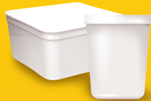
Clean plastic containers with 1, 2 and 5 recycling symbol (lids in the red bin)