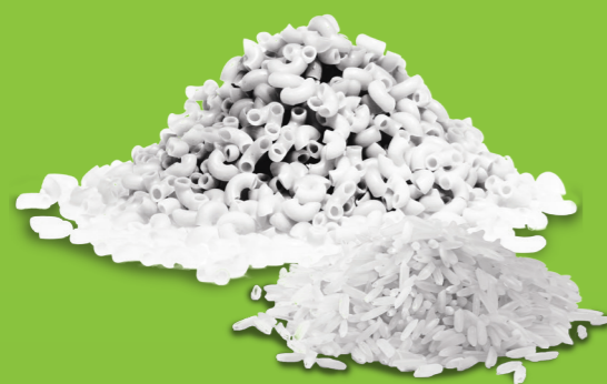
Grains, pasta and rice