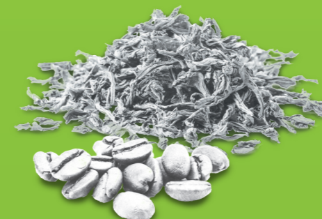
Loose tea leaves and coffee grounds