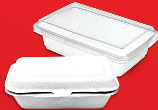
Takeaway food containers