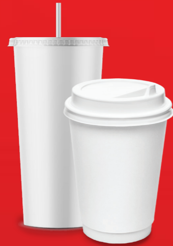
Takeaway coffee cups, drink cups and cartons