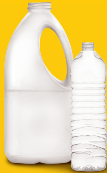
Clean plastic bottles with 1, 2 and 5 recycling symbol (lids in the red bin)