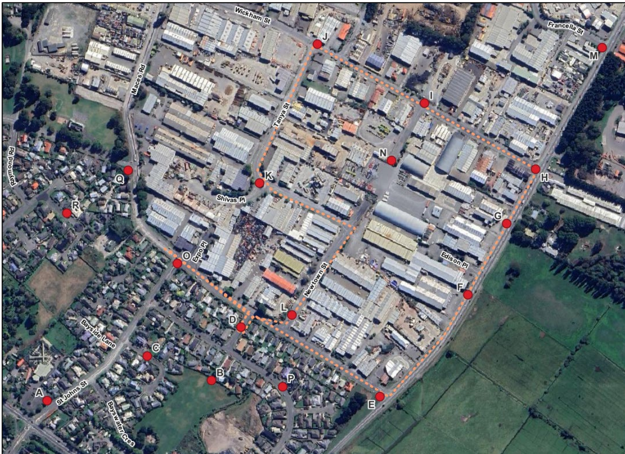
Figure 3: 1 st August 2023 - Odour Scout Route

██████ was the PDP odour scout. The scout was present for approximately 30 minutes. The weather was clear, with an average temperature of 17 °C and north-westerly to north-north-westerly winds ranging from 8.4 m/s to 9.5 m/s as a 10-minute average. The scout started and finished near Site O. The objective was to undertake odour monitoring in the area downwind of the LE Site. The odour scout route (orange dots) and key scouting locations are shown in Figure 3 .