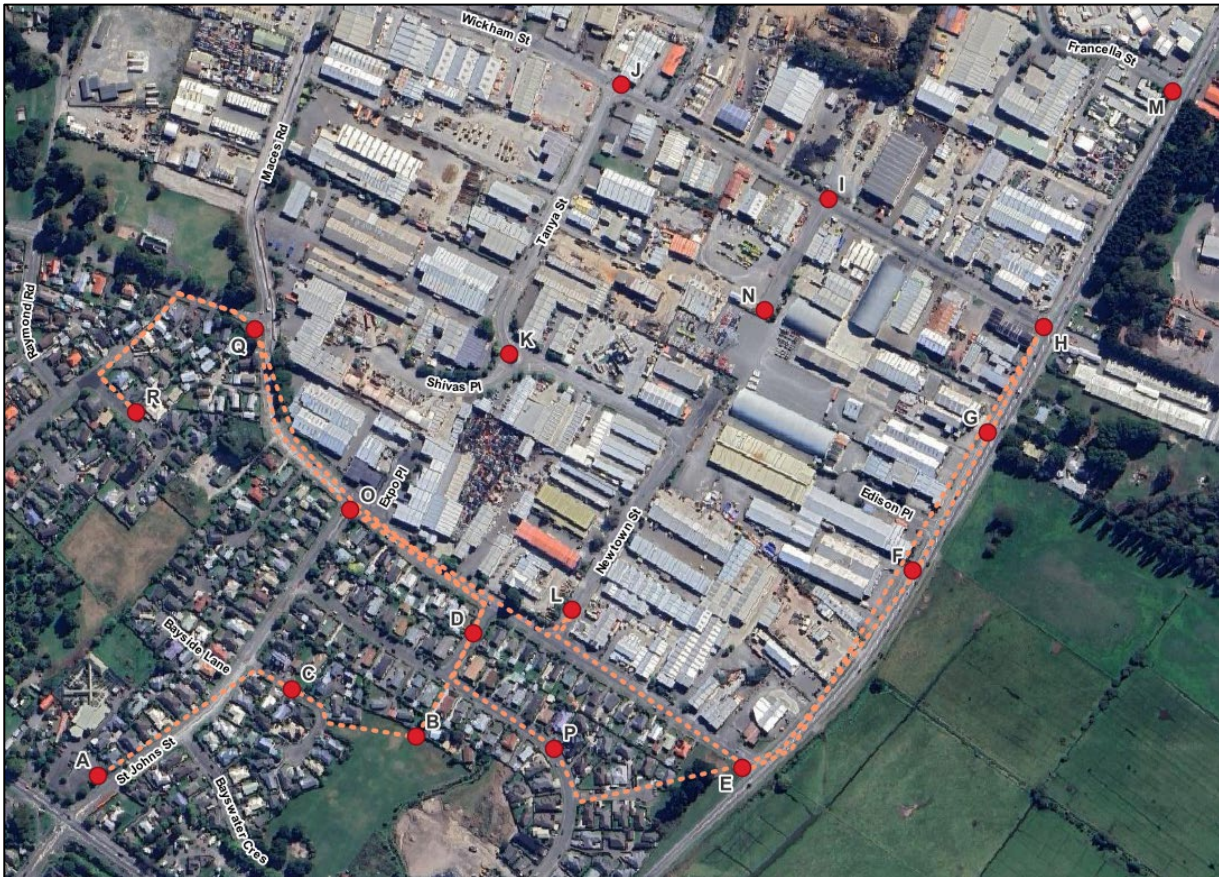
Figure 2: 31 st July 2023 - Odour Scout Route

[REDACTED] were the PDP odour scouts. The scouts were present for approximately 90 minutes. The weather was clear, with an average temperature of 13 °C and east to east-south-easterly winds ranging from 1.8 m/s to 3 m/s as a 10-minute average. The scouts started at Site A, then walked a loop, finishing back at Site A. The objective was to undertake odour monitoring in the area downwind of the LE Site. The odour scout route (orange dots) and key scouting locations are shown in Figure 2.