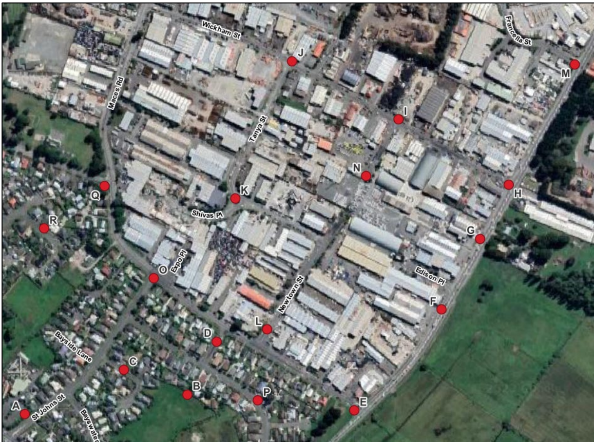
Figure 1: Odour Observation Locations

Sites H and M are immediately downwind of the site, located along Dyers Road with sites G and F. Sites I, J, K, and N are located in the heavy industrial zone. Sites A, C, B, D, P, and R are located in the residential zone. Sites E, L, O and Q are located roughly along the residential-industrial boundary. In assessments, Sites E, O, and Q are considered to be in the residential zone; Site L is in the general industrial zone.