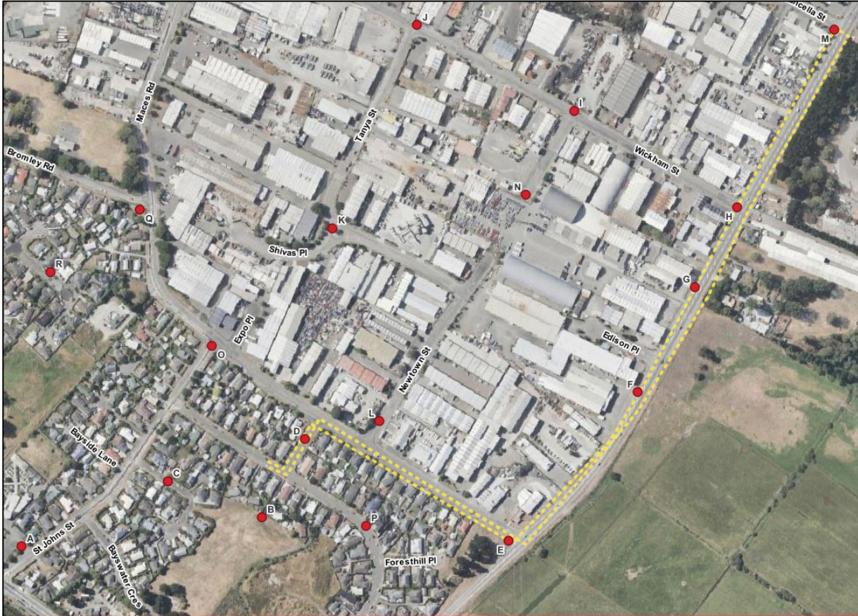
Figure 3: 23 rd October 2024 - Odour Scout Route

██████████ was the PDP odour scout. The scout was present for approximately 1 hour. The scout started near Site D, and then walked along the boundary of the industrial area towards Site M, then returning to Site D. Conditions were forecast for north-easterly conditions, however analysis of daily mean meteorological data has shown westerly winds for the 22 nd of October. The objective was to undertake odour monitoring in the area downwind of the LE Site. The odour scout route (yellow dots) and key scouting locations are shown in Figure 3 .