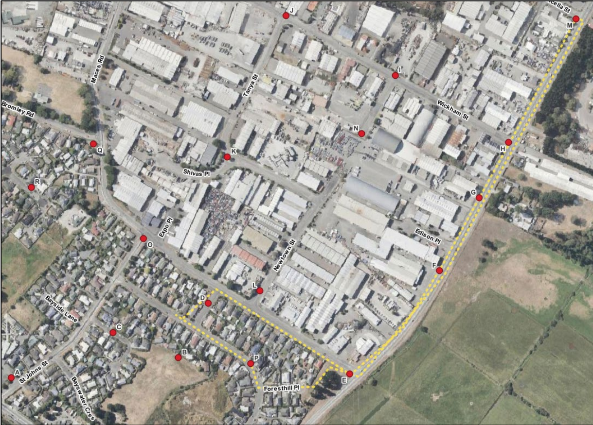
Figure 2: 22 nd October 2024 - Odour Scout Route

[REDACTED] was the PDP odour scout. The scout was present for approximately 30 minutes. The scout started near Site D, and then walked along the boundary of the industrial area towards Site M, then returning to Site D. Conditions were forecast for north-easterly conditions. The objective was to undertake odour monitoring in the area downwind of the LE Site. The odour scout route (yellow dots) and key scouting locations are shown in Figure 2 .