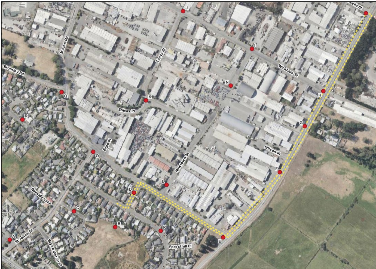
Figure 4: 30 th October 2024 - Odour Scout Route

[REDACTED] was the PDP odour scout. The scout was present for approximately 1 hour. The scout started near Site D, and then walked along the boundary of the industrial area towards Site M, then returning to Site D. Conditions were forecast for north-east conditions. The objective was to undertake odour monitoring in the area downwind of the LE Site. The odour scout route (yellow dots) and key scouting locations are shown in Figure 4 .