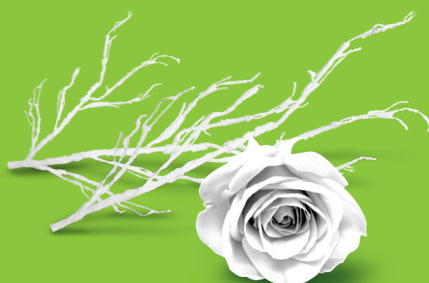
Cut flowers, cuttings, pruned branches