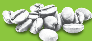
Coffee beans, grinds and loose tea leaves