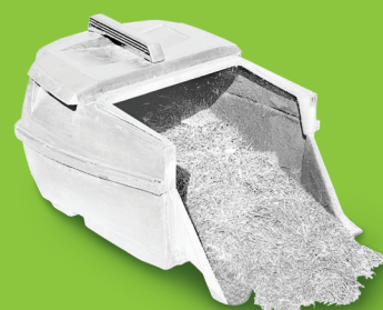
Garden waste (excluding flax and cabbage tree leaves)