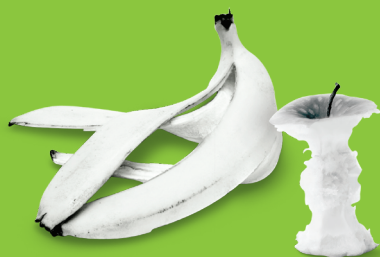
Fruit, vegetables, food scraps

Find out more at ccc.govt.nz/kerbside-changes