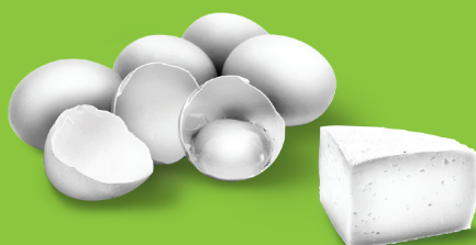
Cheese, eggs, butter