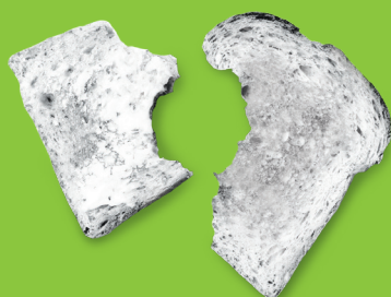
Bread, pastries, baked goods