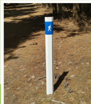
Tracks are marked by coloured blades