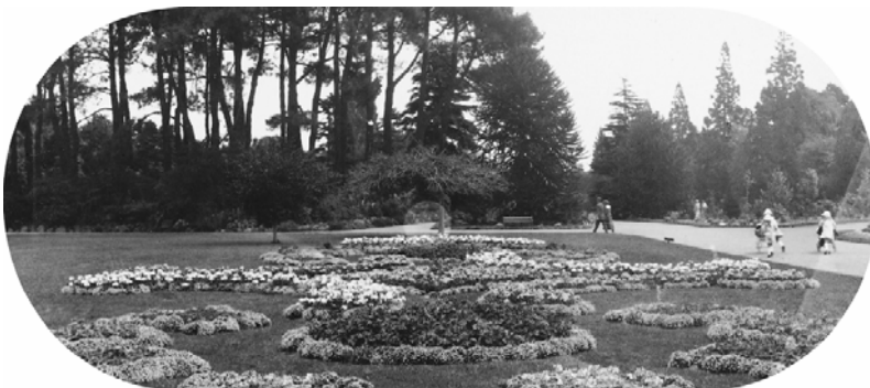
Floral beds in the Botanic Gardens early in the Twentieth Century