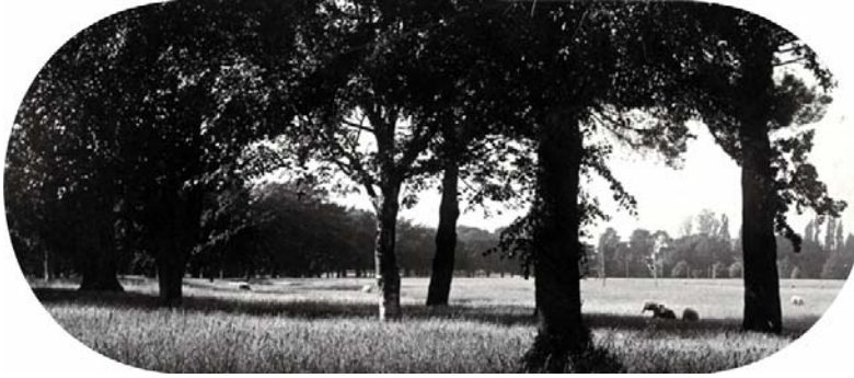
Sheep grazing in Hagley Park in 1910 (cropped).

~ valuing the past, appreciating the present and preparing for the future ~