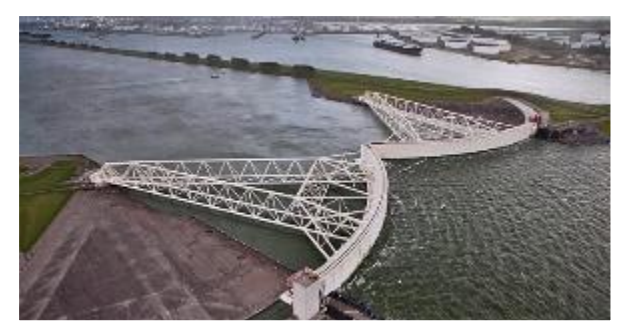
The wings of this movable barrier swing across the river as necessary in the Netherlands (Image source: Dutch Water Sector, 2018).