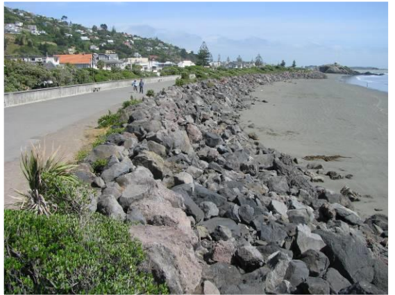
Rock revetment in Christchurch, New Zealand.