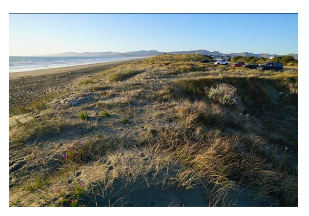
Vegetation planting to promote dune growth. Established dunes.

Dunes provide a dynamic store of sediment landward of the high tide line that changes in response to wind, waves or sea level (Linham & Nicholls, 2010). This store of sediment acts as both a barrier to water and it is able to supply sediment to the beach during times of erosion and store it again after (French, 2001; Linham & Nicholls, 2010; USACE, 2013). These functions result in dunes offering protection against both inundation and erosion risks (Linham & Nicholls, 2010; USACE, 2013).