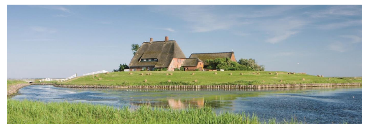
The Netherlands use artificial earth mounds called 'terps' to build homes, farms or even whole villages on.

Land levels can be raised to above an expected inundation level for the purpose of reducing current and future coastal hazard risks. In most cases, this method can be more cost effective than other structural coastal adaptation options when proactively implemented before structure construction (Lloyds, 2008; Climate Adapt, 2015). The edge of the raised land may need protection from erosion in the form of beach nourishment, vegetation planting or engineered structures such as seawalls.