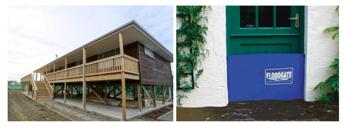
A house in Christchurch, New Zealand that is built to accommodate inundation (Image source: Property Value, 2021).