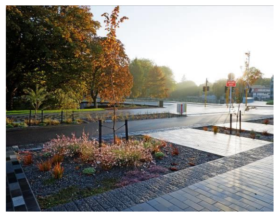
Rain gardens collect and filter storm water before it infiltrates into the groundwater.