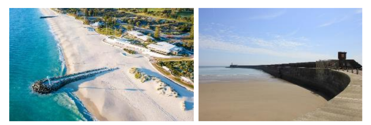
Concrete and rock groyne (Image source: Town of Cambridge, 2020).