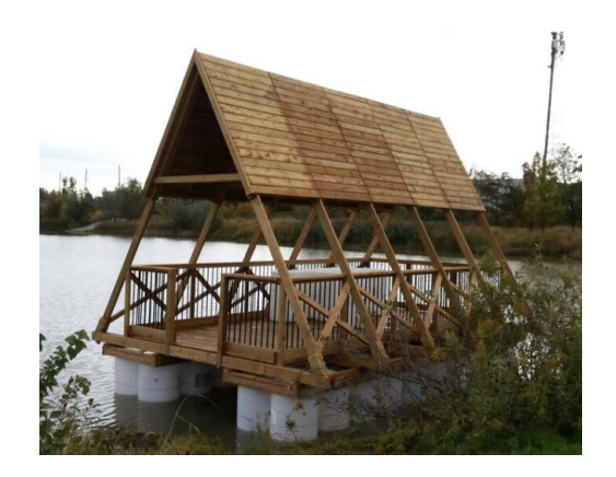
This amphibious pavilion is built on pontoons to increase its resilience to inundation.

Adaptable buildings are designed to respond to an environmental change while avoiding structural damage. Adaptable buildings allow for the recognition of the high demand and property value in coastal areas while avoiding the construction or expansion of protection structures and also providing measurable cost savings compared to other options (English et al., 2016; CTCN, 2017). An adaptable approach to planning and building also helps people to recognise that seasonal and occasional inundation will occur and that we must live with water (English et al., 2016). As with flood proofing, these types of options do not address all components of coastal hazards.