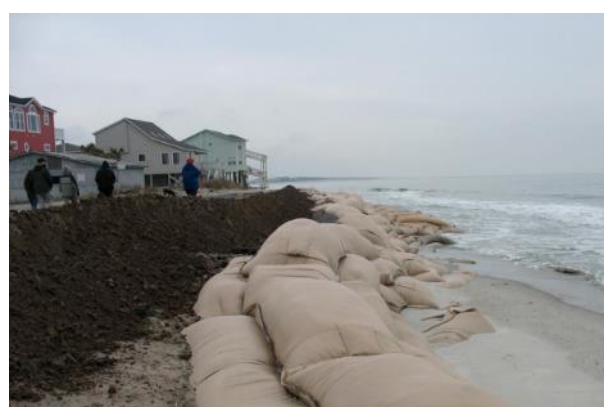
Emergency sand bagging (Image source: Coastal Care, 2010).

Emergency management tools such as hazard mapping and warning systems improve community awareness and understanding of hazards which can then minimise the impact of them (Linham & Nicholls, 2012; Geological and Nuclear Sciences, n.d.). Although these tools do not reduce the risk of hazards themselves, the responses that come as a result of this management such as evacuation plans, civil defence emergency management, temporary accommodation and protection measures do increase community resilience and reduce the risk to hazards (Linham & Nicholls, 2010).