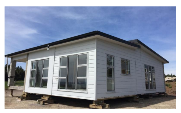
Relocatable homes can be moved