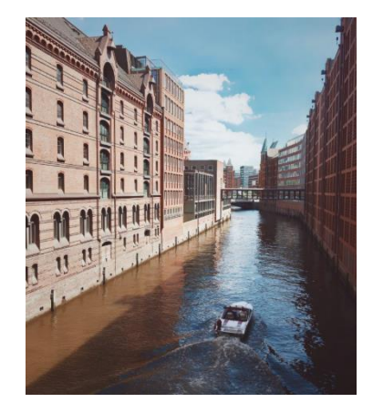
Dyke houses forming a flood barrier in Hamburg, Germany.