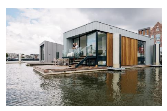
Floating houses sit on top of the water all year long.