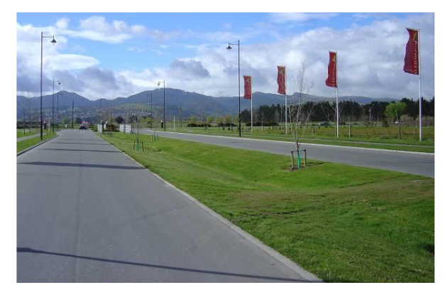
Swales collect and divert surface water to flow in desired location.