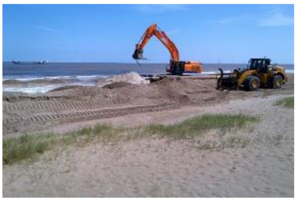
Redistribution of sediment (Image source: Environment Agency, 2019).

Shoreline nourishment involves the addition or redistribution of sediment on foreshores, beaches or dunes to help maintain or advance the shoreline position (Linham & Nicholls, 2010). This can help combat erosion by providing a temporary buffer zone, allowing waves to run up and dissipate energy, and addressing the sediment deficit – the cause of erosion – by increasing the volume of sediment available in the system (French, 2001; Linham & Nicholls, 2010).