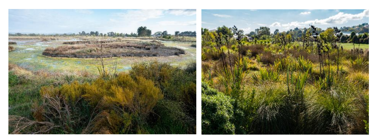
Wetlands such as the Brooklands wetland in Christchurch, New Zealand can provide flood and erosion protection, environmental benefits and recreational amenity.