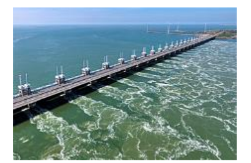
Permanent barrier in the Netherlands with gates that open and close.

Storm surge barriers are hard engineered structures that are primarily designed to prevent inundation due to storm surges in tidal inlets, rivers and estuaries, while also decreasing reliance