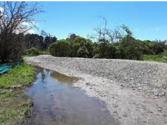
Vegetated stopbank protecting a road from flooding in Ngātea, New Zealand.