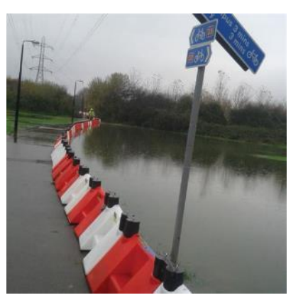
Temporary flood barrier (Image source: Fluvial Innovations, 2017).