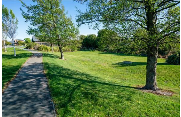
Retention basins are areas of relatively lower ground elevation where surface water can collect without affecting the use of an area.

The hard landscapes of urban environments brought about by pavements, roads and other impermeable surfaces change the flows in urban waterways. For example, waterways may experience sudden surges in volume and velocity during heavy rainfall as a result of stormwater running off impermeable surfaces rather than infiltrating into soils (Foster, 2016).