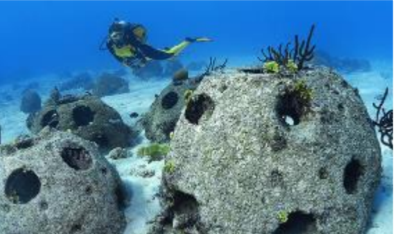
Textured concrete balls forming an artificial reef.

Detached breakwaters are usually constructed of rock and rubble and are placed parallel to the shoreline with a height slightly above the water level (Climate Adapt, 2015). The purpose of detached breakwaters are to reduce the wave energy that is reaching the shore through the dissipation, reflection and diffraction of oncoming waves (UNFCCC, 1999; Nordstrom, 2013). This creates a low-energy environment close to the shore that encourages the deposition of sediment,