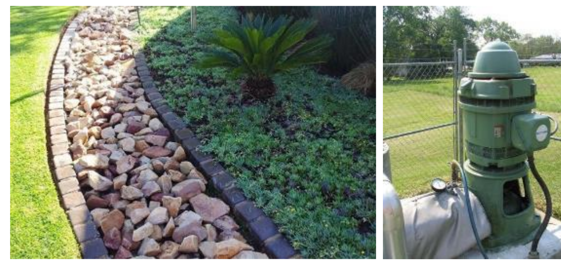
'French drain' utilises pipes below permeable materials (Image source: Tigard Sand and Gravel, 2020).