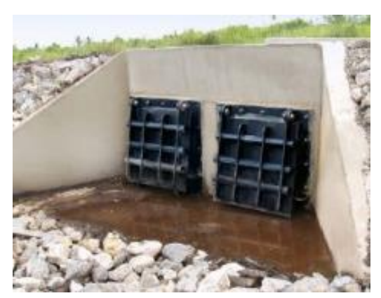
Flood gates allow water to flow out but not in prevent saltwater intrusion.

Similar to flood proofing buildings, flood proofing infrastructure such as wastewater, stormwater and drinking water infrastructure, telecommunication infrastructure, and roads may involve modifying existing infrastructure or designing new or replacement infrastructure to withstand coastal hazards (Linham & Nicholls, 2010). This can be done by reviewing design standards, upgrading and replacing assets using more resilient designs and materials, and embedding hazard resilience into the planning process. As mentioned above in section 5.1, flood proofing measures are best applicable to coastal areas with a small inter-tidal range and where flood depths are low (Linham & Nicholls, 2010). It should be noted that this option may involve land acquisition (discussed in section 7.1) where modifications are reliant on the ability to expand the footprint of infrastructure, for example where roads are being elevated or moved, or the capacity of storm-water retention infrastructure is being increased.