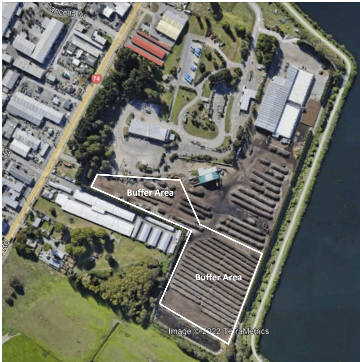
Figure 3: Current buffer area

The immature tailings are reused within days of production so do not require turning. The reduction in volumes and removal of the need to turn the windrows has resulted in a reduction in the nuisance odour generation potential at the Living Earth site.