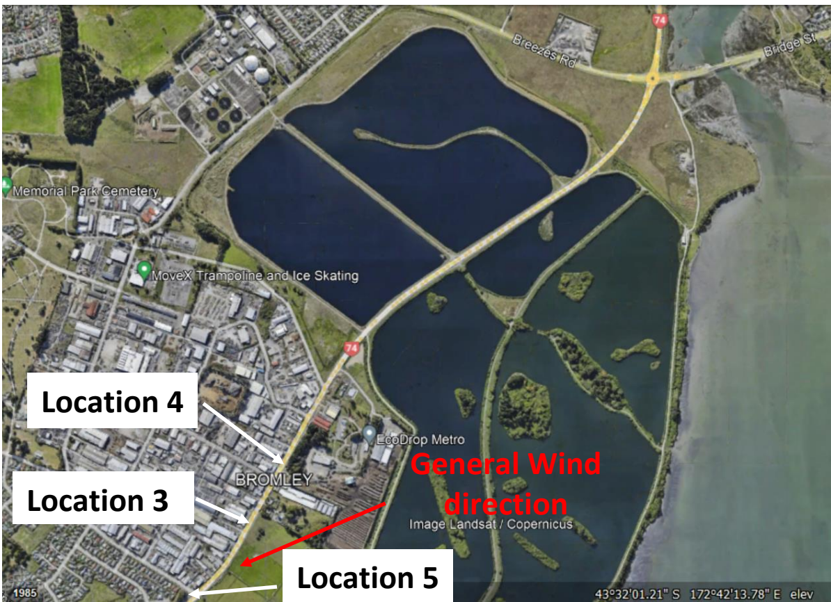
Figure 5: Odour scout locations 26 January 2022