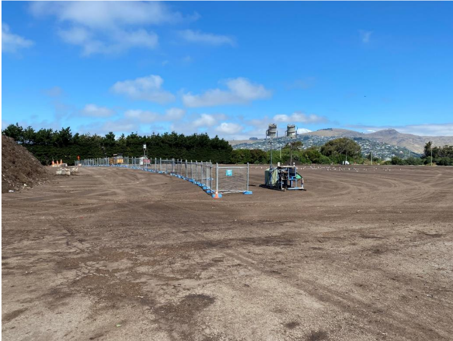
Figure 1: Fence separating the operational area from the newly created southern buffer zone

The change to the compost maturation process has resulted in a large reduction in material being stored onsite. Windrows have been removed from the southern and western end of the site to create a buffer area between the operations and the site boundary downwind of the prevailing north easterly wind which will further reduce the potential for offsite offensive of objectionable odour (see Figure 2 , Figure 4 and Figure 4 ). Additionally, fog cannons have been placed along this boundary to provide mitigation against dust discharges from the operational portion of the Living Earth site.