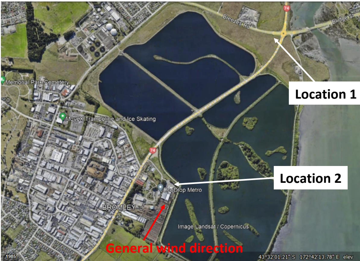
Figure 4: Odour scout locations 20 January 2022