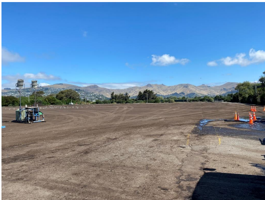
Figure 2: Southern end of the Living Earth site with windrows removed