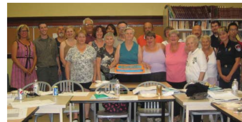
Keith Neighbourhood Planning Team celebrates the completion of the Neighbourhood Action Plan with cake! July, 2012.

See Section 3: The Toolkit, Tool M - Activity Tracker.