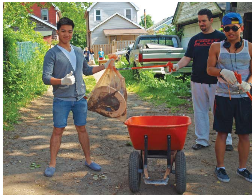
Keith neighbourhood volunteers work to clean up an alley way during the Keith Action Planning Team “Quick Win.”

Well-established neighbourhoods may not need a quick win component of the Neighbourhood Action Plan for two reasons; they may take less time to develop a plan, and they may have already tackled quick win projects within their neighbourhood prior to the action planning process occurring.