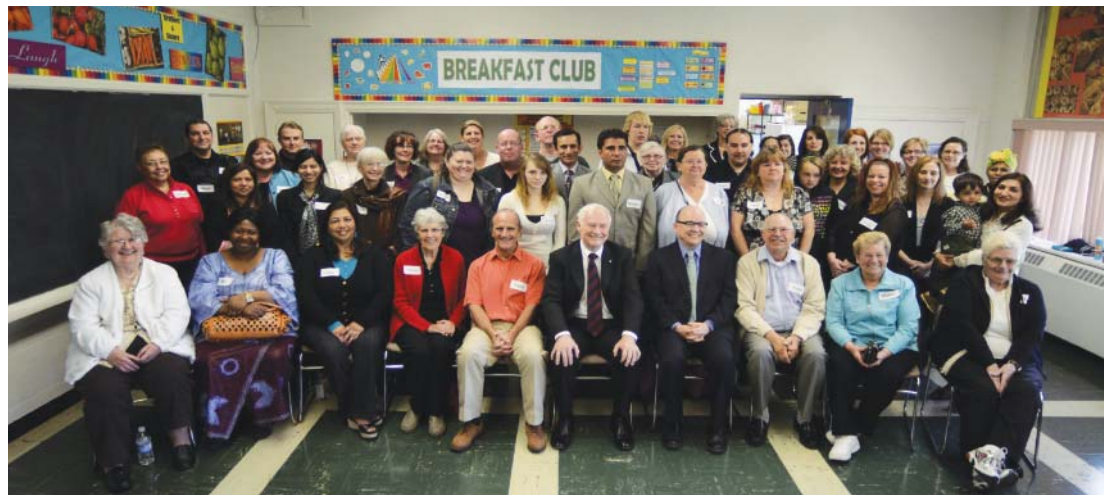
His Excellency the Right Honourable David Johnston, Governor General of Canada visits the McQuesten Local Planning Team, April 2012. The McQuesten Local Planning Team celebrated its 10 year anniversary in 2012.

In neighbourhoods where a strong planning committee or neighbourhood association already exists, it's recommended that the new planning team not be a stand-alone group without any ties to this existing association. There needs to be a clear and agreed upon relationship between the new planning team and the existing association. The planning team may become a sub-committee of the established association, or the established association itself may become the planning team. This relationship must be a clear and collaborative one so that the neighbourhood takes ownership of the creation and implementation of a successful Neighbourhood Action Plan.