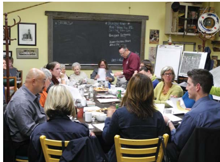
Keith Action Planning Team Kick-Off Meeting at local restaurant October, 2011.

The neighbourhood action planning team needs to discuss and agree on a communication plan so that all residents can be kept informed of the planning progress and status of the work. The communication plan also needs to consider when and how resident feedback is gathered.