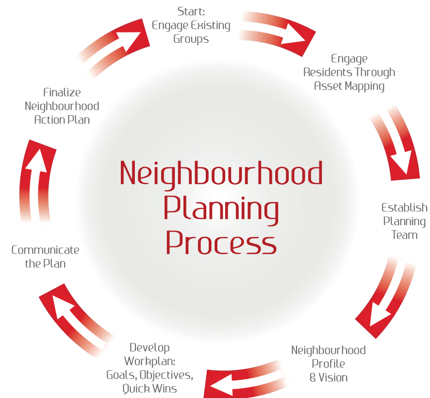
Figure 1: Neighbourhood Action Planning Process 12

Each step in the neighbourhood action planning process is described on the following pages. A template for a Neighbourhood Action Plan can be found in Section 3: The Toolkit, Tool A - Neighbourhood Action Plan Template.