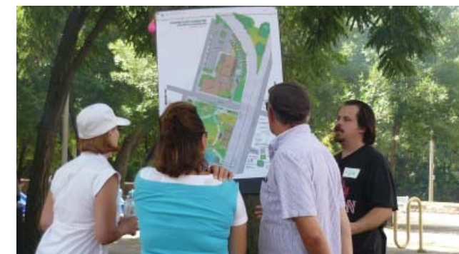
Stinson Neighbourhood Action Planning Team members discuss their Park Make-over plan with residents at their Community Engagement BBQ. July, 2012.

At a minimum, the neighbourhood action planning process should engage the neighbourhood at the following points: once the vision is drafted; when the goals/objectives are identified and when the workplan is complete. Face-to-face conversations, attending other committee meetings in the community (e.g., Parent Council in schools, other organizations or associations), town hall-style meetings, and regular written updates via a newsletter or e-blast are tried and true methods for communicating and gathering information. Whatever methods are used, touching base regularly with the neighbourhood is essential to the development and success of the Neighbourhood Action Plan.