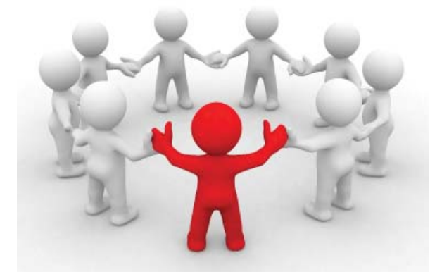
Connect with existing groups in a neighbourhood