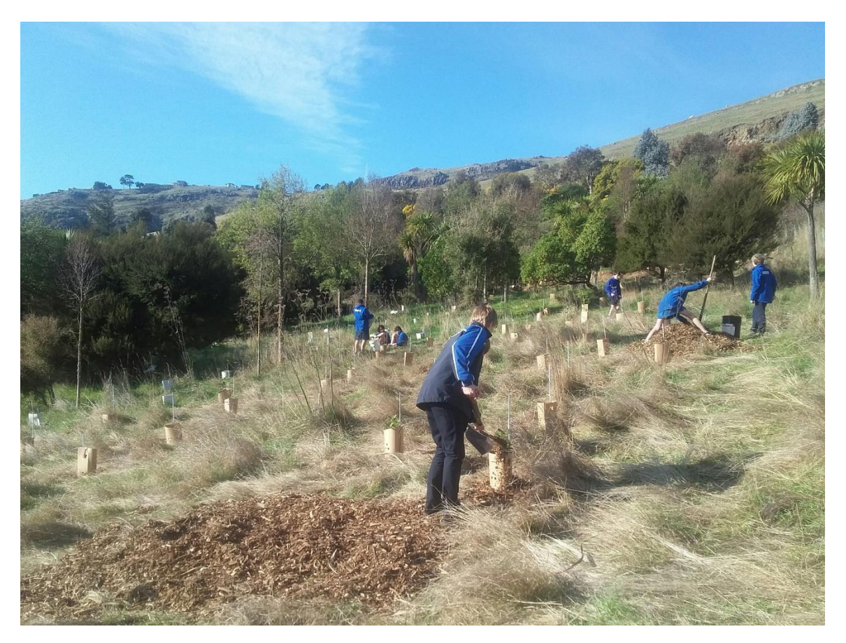
Heathcote Valley School Enviro group working at Birdsey Reserve in 2020.