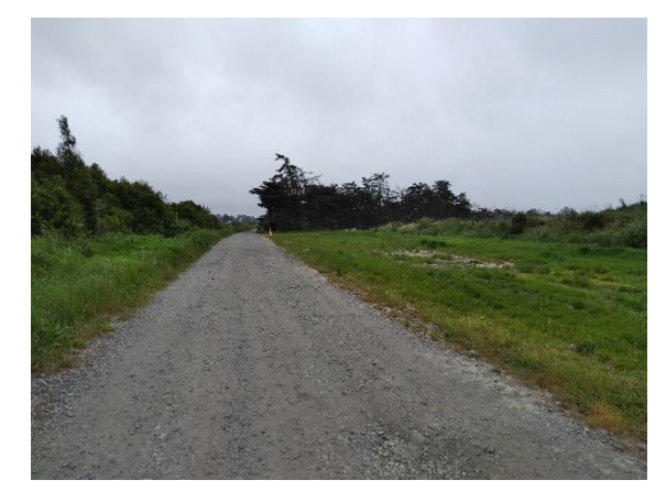
Suggested dog park area. View from Tunnel Road.