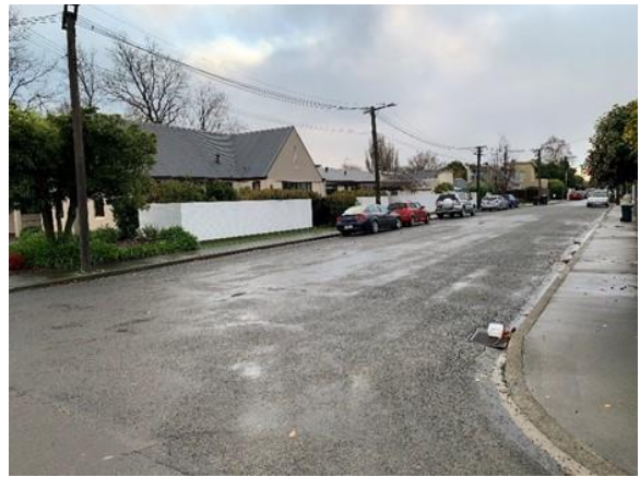
Tuesday 1 June 2021, 5:15pm