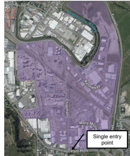
Figure 1: Approximate area of industrial land that would have one entry via Port Hills Road with current proposal.