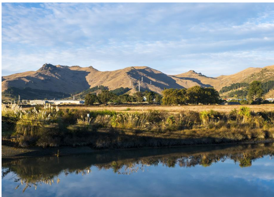
View of Linda Woods Reserve from the estuary

We would be very happy to provide an update to the Banks Peninsula Community Board on our plans for Linda Woods Reserve. If hearings are held, we would like the opportunity to speak to our submission.