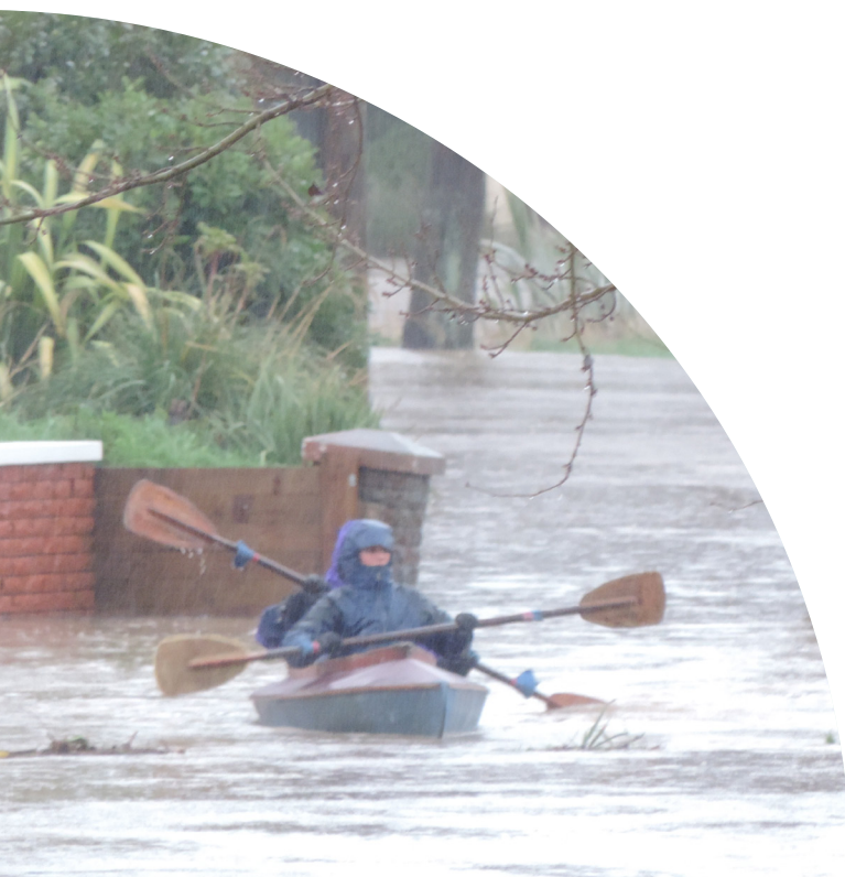
Flooding of the Ōpāwaho/Heathcote River in 1975.

The Council's Land Drainage Recovery Programme investigated the impacts of the earthquakes on flooding risks, with the aim of returning the flooding risk to houses to pre-earthquake levels. We are developing a floodplain and river model to improve our understanding of the risks to houses on the floodplain. The model will better represent the effects of sea-level rise over this stormwater management plan's period.