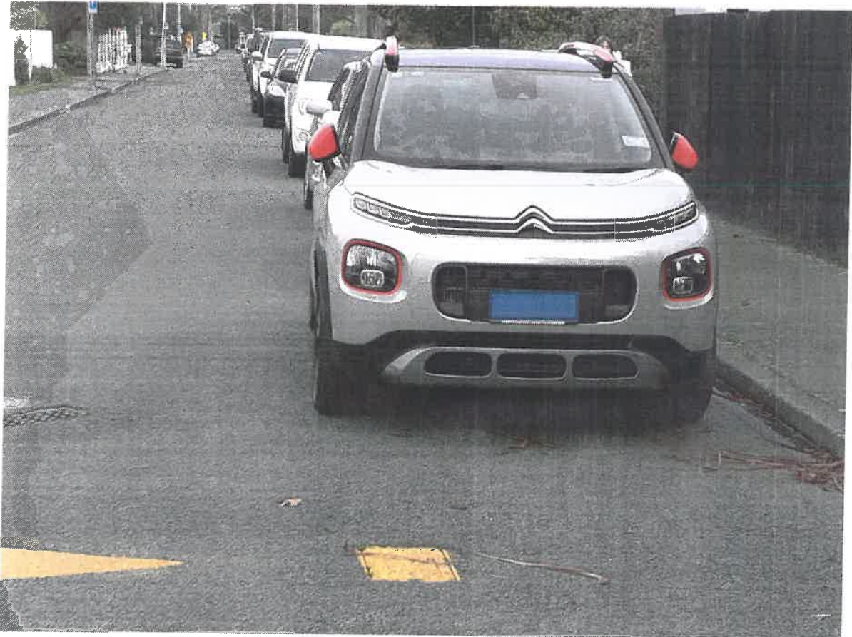
Current vehicles parking on the Western side of the street in line with the fire hydrants.

Our concern is in relation to vehicle parking on both sides of the road limiting the available road way to less than 3.5m. In reality restrictions would be as low as 2.0m at best which is narrower than a standard fire appliance. Whilst minimum road way width is not a requirement under the building code for Sleeping Household SH (Single Household units and small multi-unit dwellings) there has been the recent construction of a sizable multi-unit dwelling in the street.