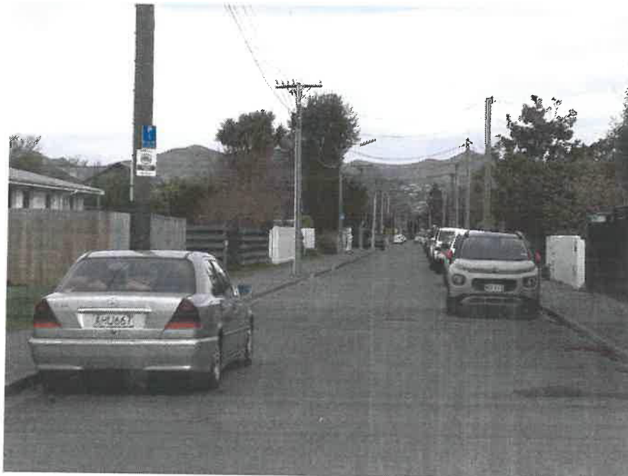
Perth Street looking south from Avolon St intersection.

Perth Street is described as a narrow street with curb and channel guttering on both the west and east sides. Pedestrian foot paths are then also on both sides to property boundaries. A narrow grass verge is on the eastern side of the road between the footpath and the property boundaries. On the Western side of the road is a Fire Hydrant Reticulated Main system running approximately 1.8m from the curb.