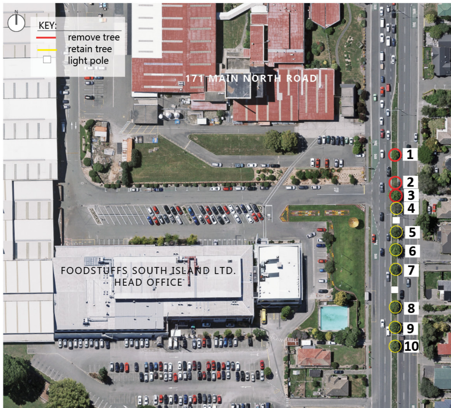
APPENDIX A - MEDIAN TREE INSPECTION dated 23 April 2019