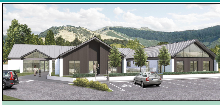
Artist impression of the Akaroa Health Centre

Saturday 9 March 2019, 9.30 am - 11.30 am Akaroa Farmers Market Madeira Car Park, 48 Rue Lavaud, Akaroa