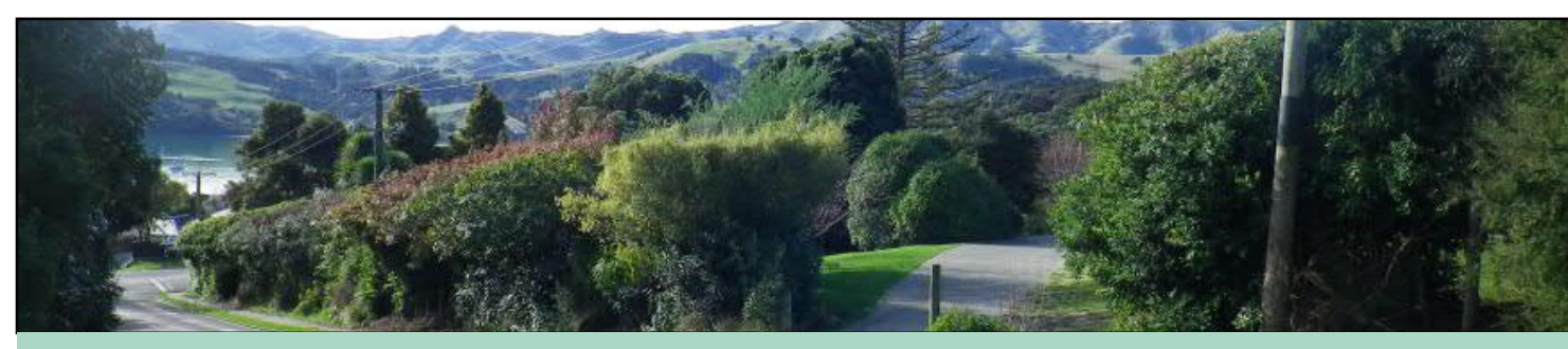
Akaroa Community Health Centre site