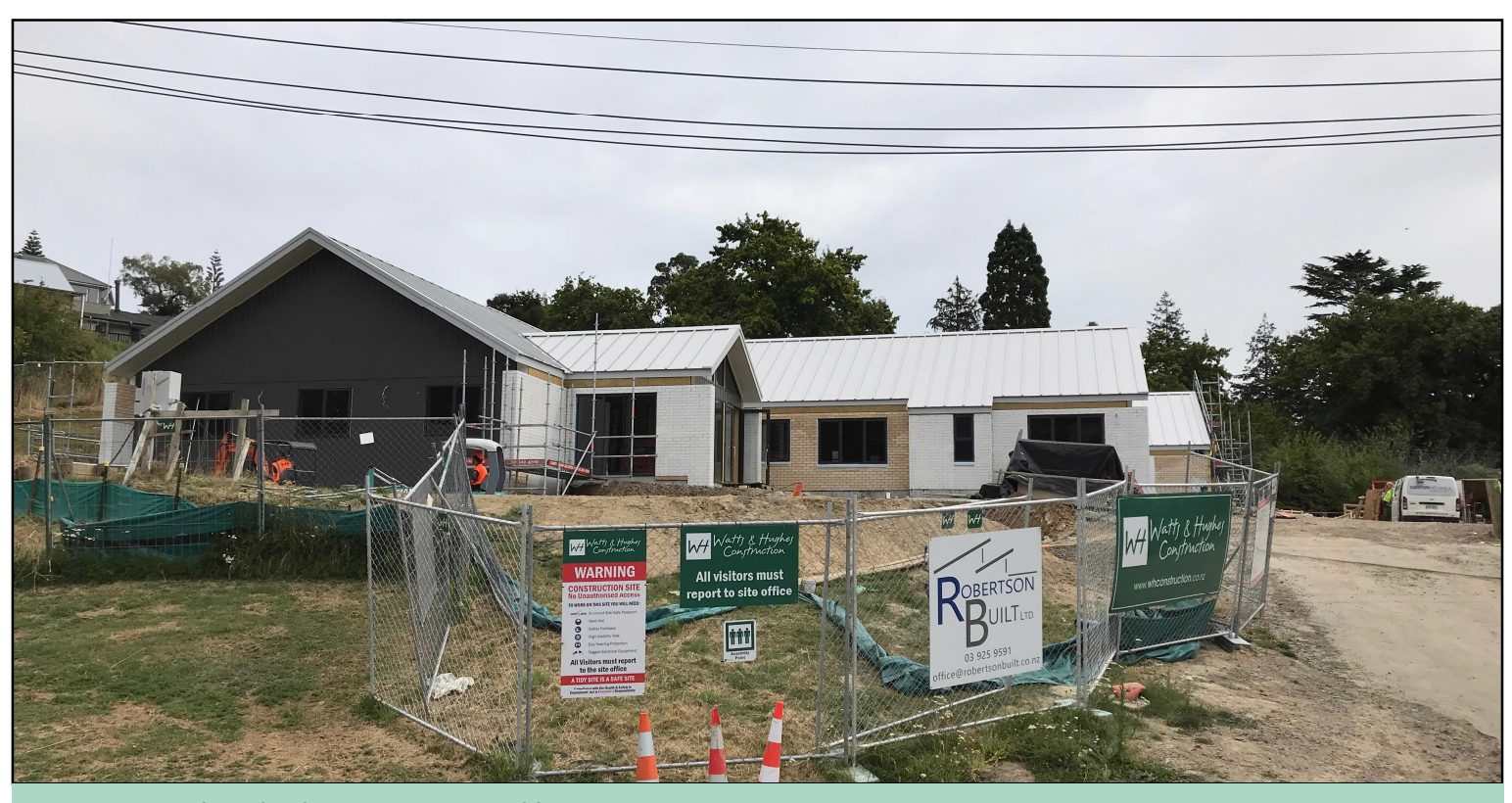
Construction works at the Akaroa Community Health Centre site