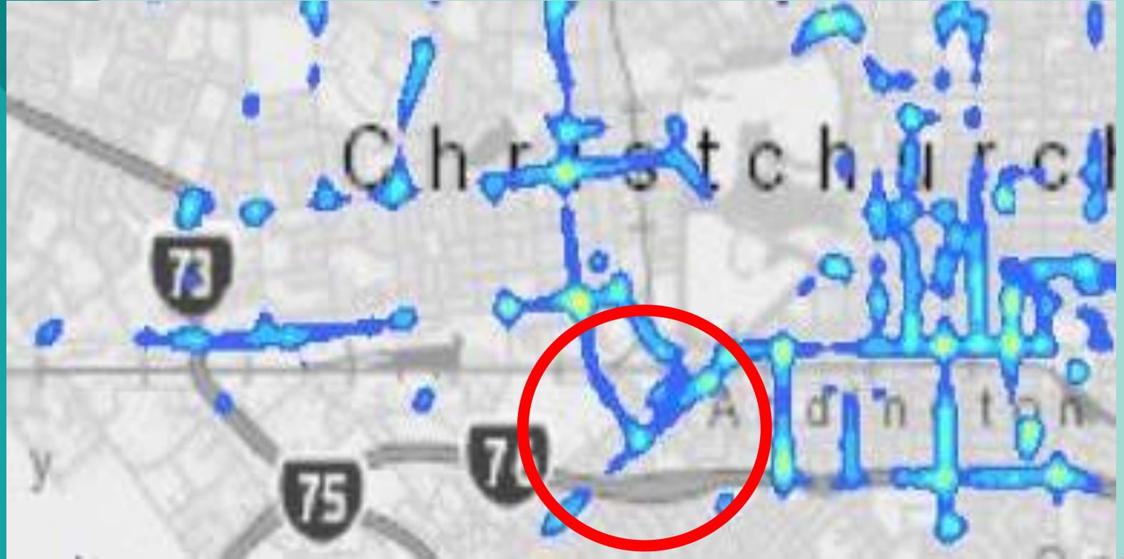
PM Peak Bus Travel Times 2016 – Speed Heat Map