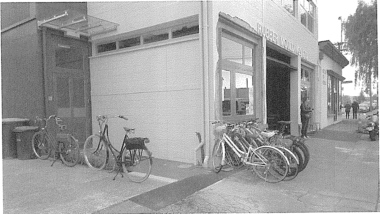
The Anchorage, Walker Street - 13 October at 08:46am