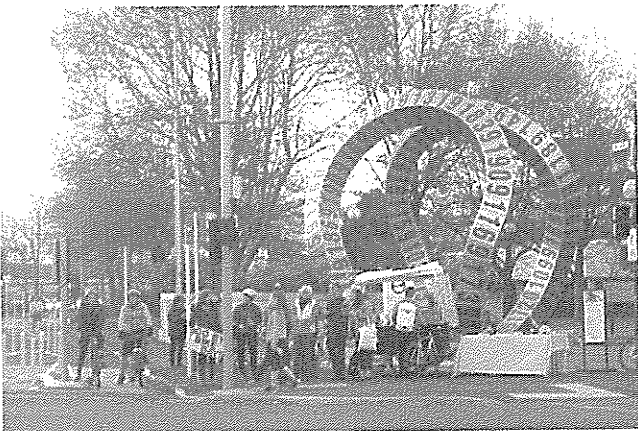
Action Bicycle Club - Go by Bike Breakfast St Asaph St - June 9th. 300 cyclists counted