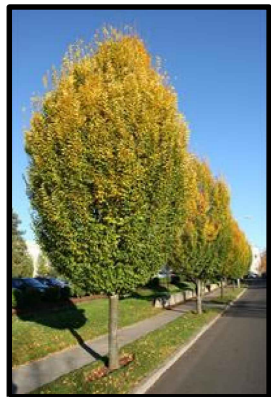
Carpinus betulus fastigiata Upright Hornbeam