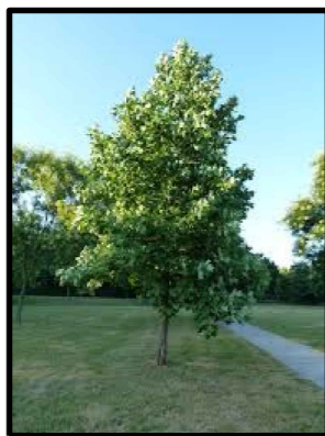
Liriodendron tulipifera Tulip Tree

Original size mm 100 50 30 10 0