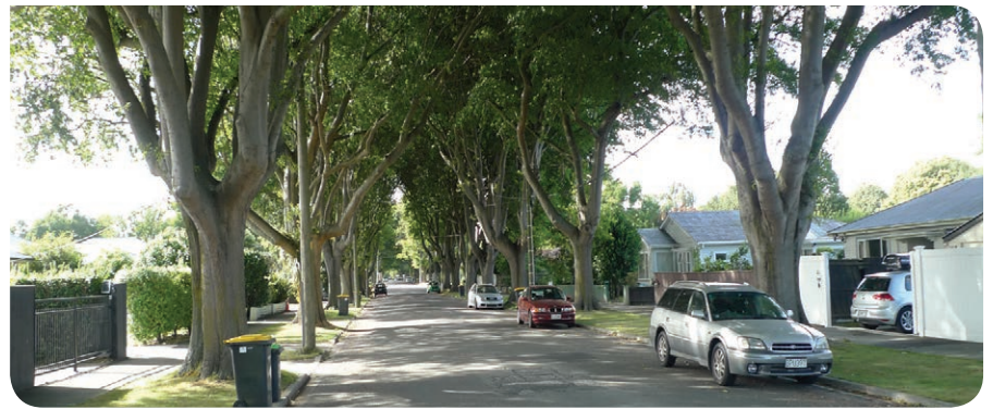
Mature tree avenue along Severn Street