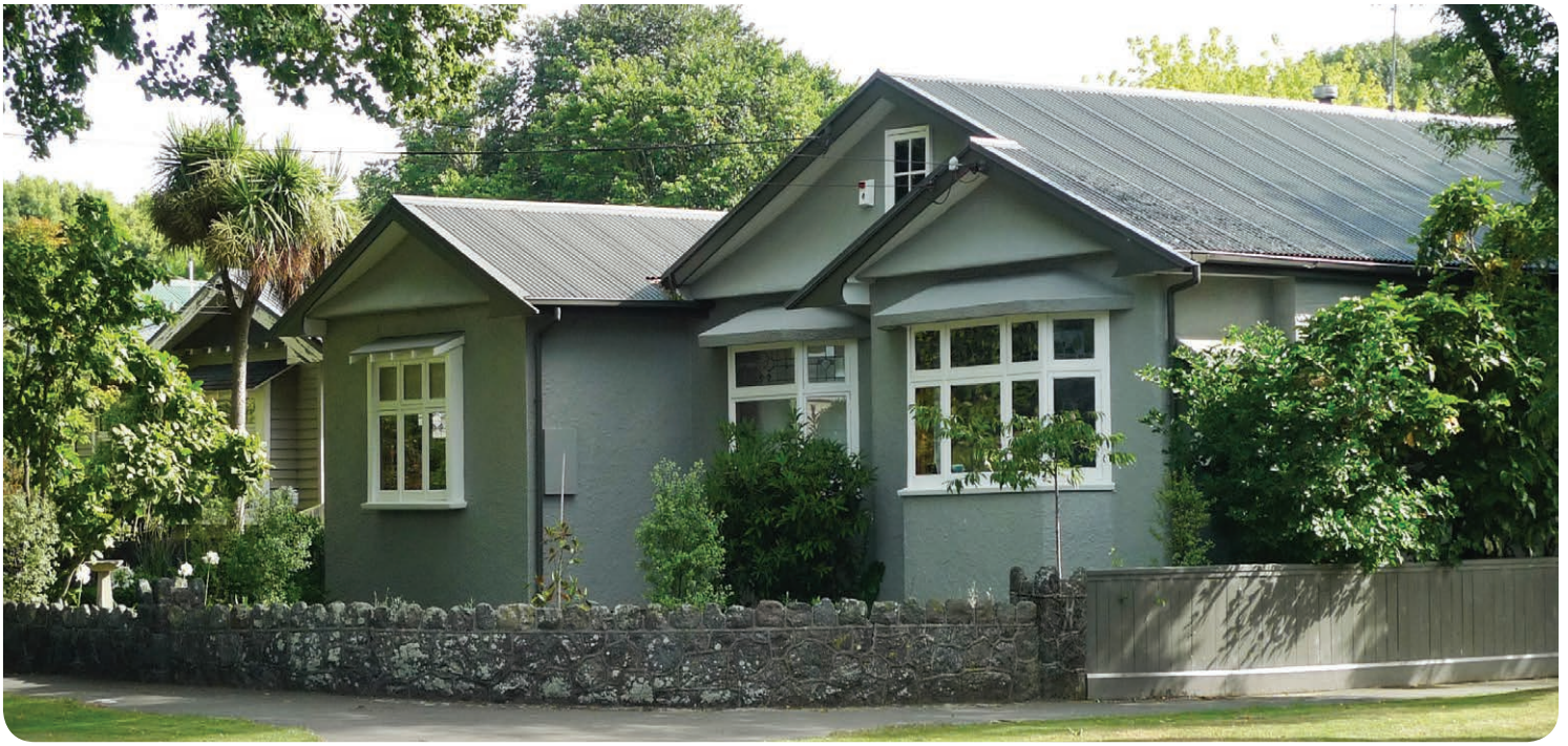
Example of a bungalow on Mersey Street