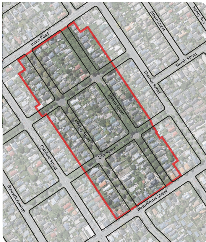
Map of Severn Character Area

Designing to the character of the area does not need to be about replicating original houses. Consider how key elements contribute to the character of Severn. How might they be incorporated into the design so that new houses and the surrounding landscape complement the existing? This will help ensure that the development reinforces the character of the area future generations can appreciate.