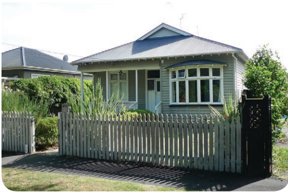
Example of a bungalow on Severn Street