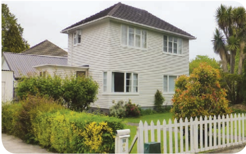
Example of duplex houses on Shand Crescent