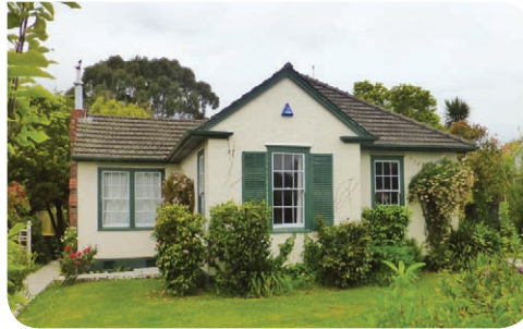
Example of a house on Piko Crescent