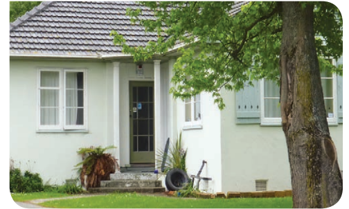
Example of the attention to front entry detailing