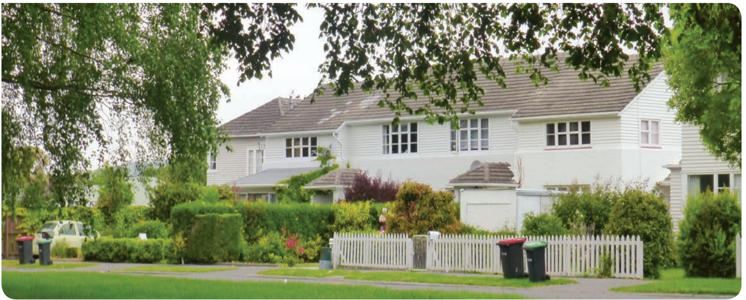
Example of a row of houses on Shand Crescent