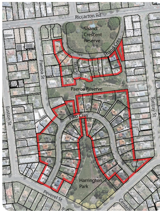
Map of Piko Character Area

Piko has city-wide significance as an intact residential neighbourhood with a strong sense of place and identity. This comprehensively designed state housing development, established in the late 1930s, has historical importance. The key elements that contribute to the character of Piko are: