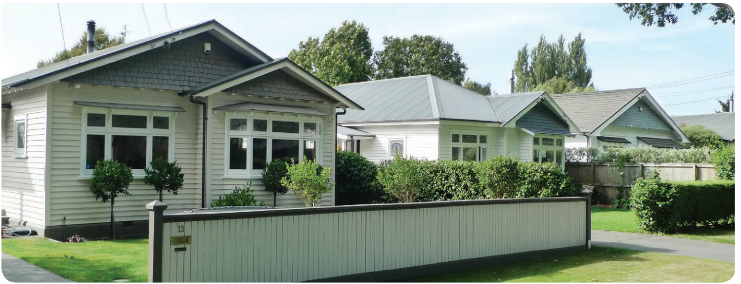
Example of a bungalow on Massey Crescent