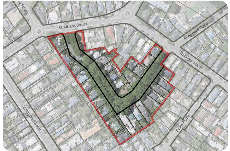
Map of Massey Character Area

* For further District Plan advice please contact Christchurch City Council on (03) 941 8999 and ask for a Duty Planner, or for design assistance ask for an Urban Designer.