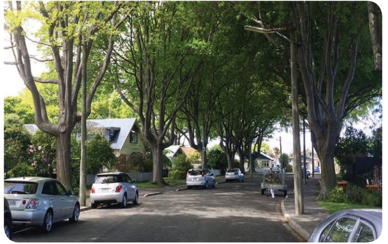
Street trees on Massey Crescent