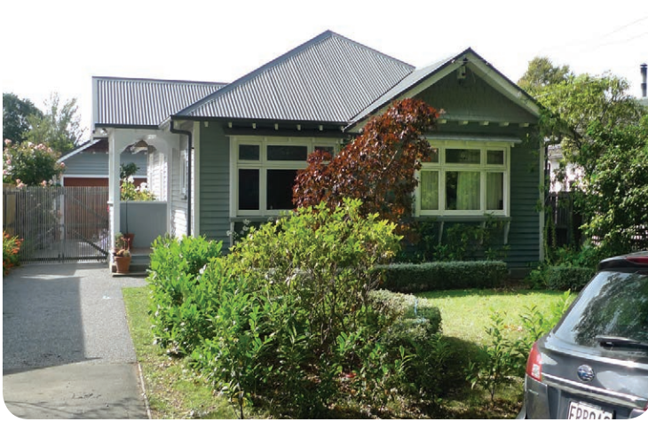
Example of a side-entry bungalow on Massey Crescent