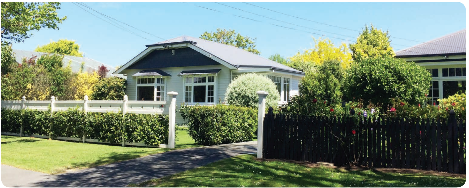
Example of a bungalow in Malvern