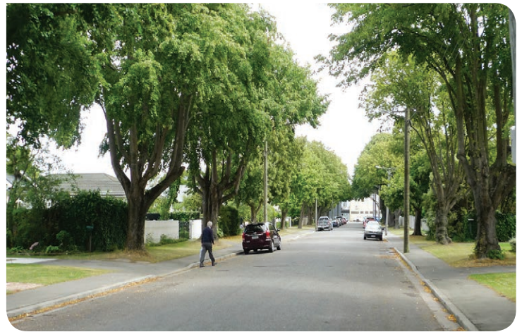
Tree avenue on Gosset Street