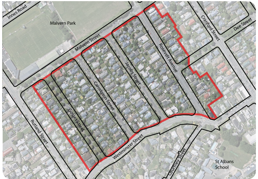
Map of Malvern Character Area

* For further District Plan advice please contact Christchurch City Council on (03) 941 8999 and ask for a Duty Planner, or for design assistance ask for an Urban Designer.