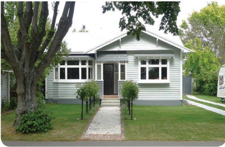
Example of a bungalow in Malvern