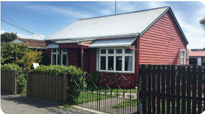
Examples of Victorian workers cottages on Hanmer Street