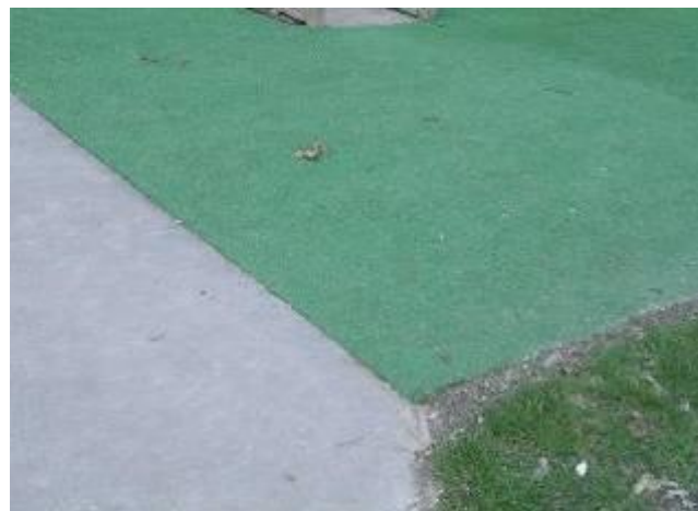
Safety matting playground surface. This playground surface has a flush surface level with no border.