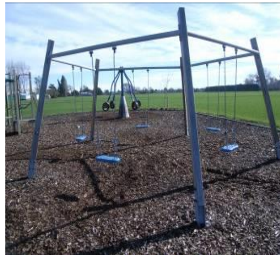
A swing with five standard seats.

Swings allow a person to oscillate back and forth in a pendulum like motion. Typically, a swing is a seat suspended from an overhead beam by chains. More than one seat can be suspended from the same beam. A standard swing seat is a flat board or flexible belt that is sat on. An infant swing seat has holes for legs, a safety belt in the front and a high back. Disabled swing seats are platforms capable of wheelchair access. When recording swings the total number of swing seats, number of standard swing seats, number of infant swing seats and the number of disabled swing seats must be recorded.