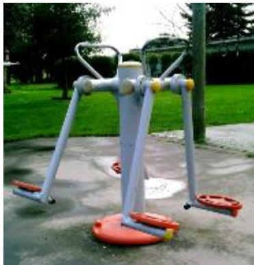
Moving Multi Exercise – Structure that combines more than one exercise and is built with moving parts