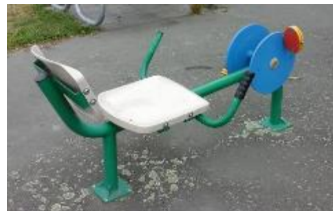
Moving Single Exercise – Structure that is designed for one exercise and is built with moving parts