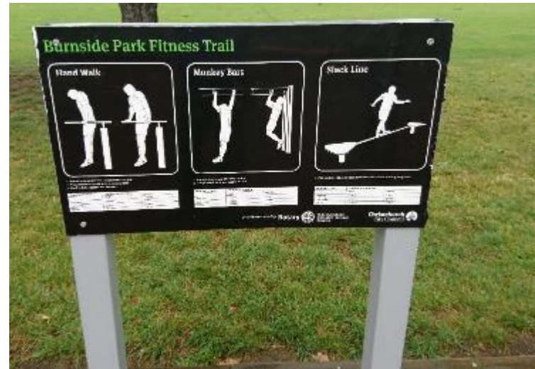
Example Signage associated with Fitness Equipment