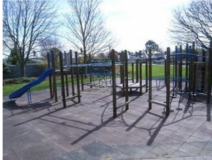
Senior Modular Unit Type