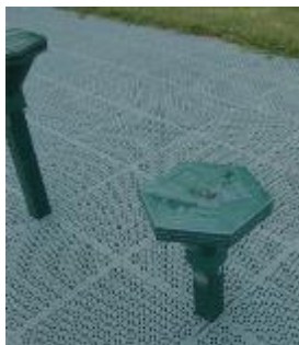
Stepping Stretch – Stand on one step and stretch to next one.