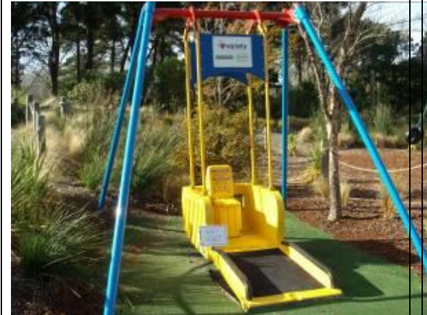
A disabled swing seat.