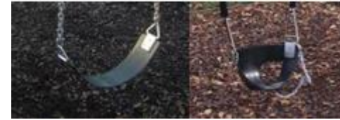
Standard and infants swing seats.