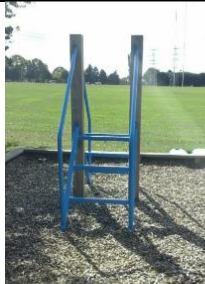
Stair Climbing Frame