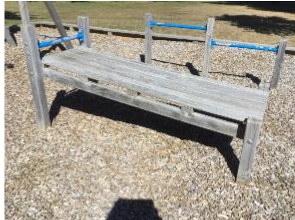
Sit Up Bench