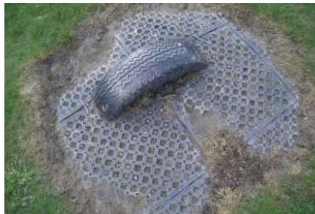
Matta tile playground surface. This playground surface has a flush surface level with no border.