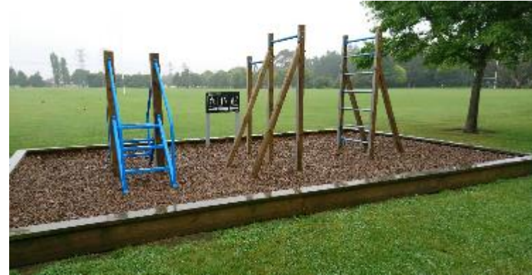
Example of Fitness Station