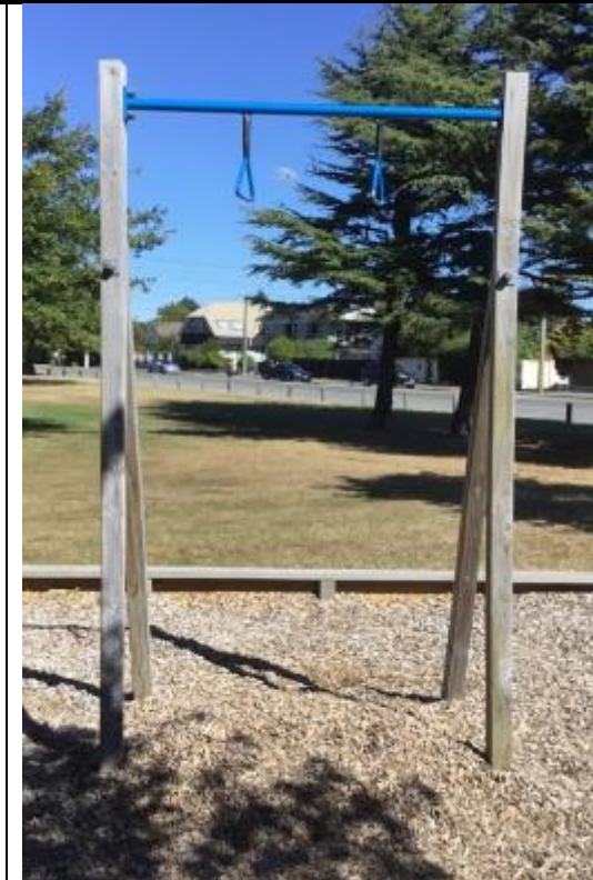
Chin Up Bar