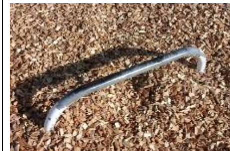
Push Up Bars