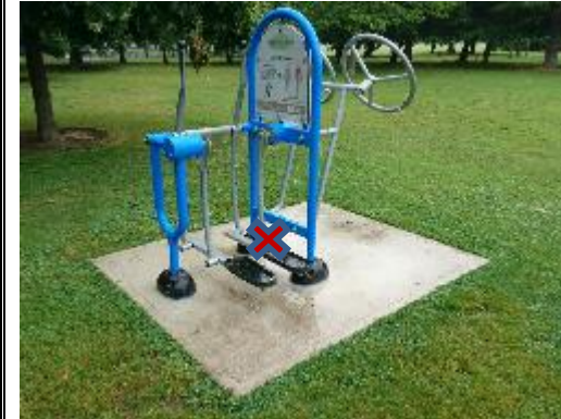
Moving Multi Exercise