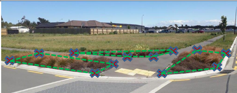
Further examples of amenity low growing shrub gardens. Note how these three assets have been split out from each other.