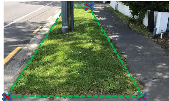
Standard residential turf.

Turf is a grass area mowed once or more every year. If a grassed area is mowed less than once a year it should be classified as grassland under natural areas.