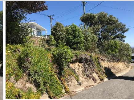
Terraced garden examples. Where difficult to define boundary like in upper right-hand image, please confer with CCC staff.