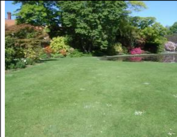
Amenity Turf – The presence of daisies and weeds differentiates this from ornamental turf.