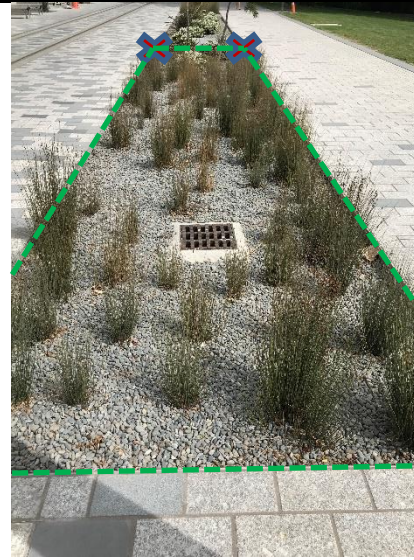
Rain garden example.