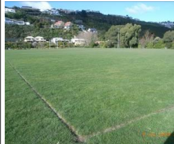
Sports Turf – The presence at all parks with sports fields. Sports turf includes all turf available for sports to be played on and not just the area marked out as sport fields.