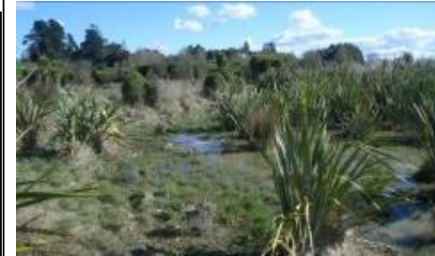
Natural wetland area