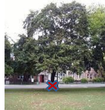
Quercus robur, common name English Oak.