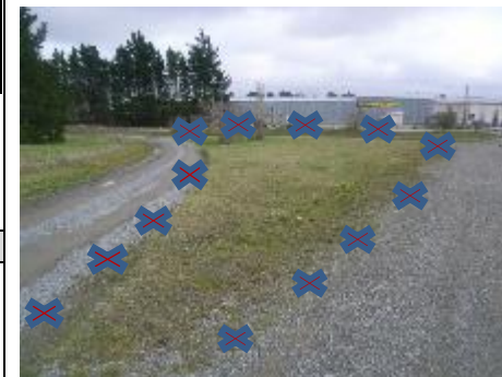
Informal turf - Common in rural or semi-rural areas. This turf receives a minimum of maintenance.