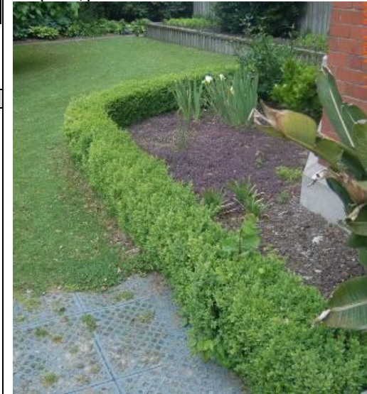
Amenity hedge around a garden.

If the dominant species field can be accurately completed, please do so.