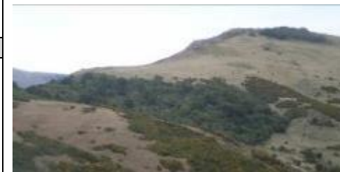
Areas of native bush, dark green trees, scrub, gorse and grassland.