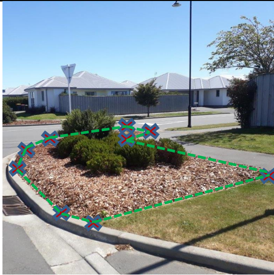
Standard amenity low growing shrub garden.