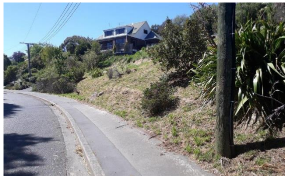
Example of a fire mitigation area.