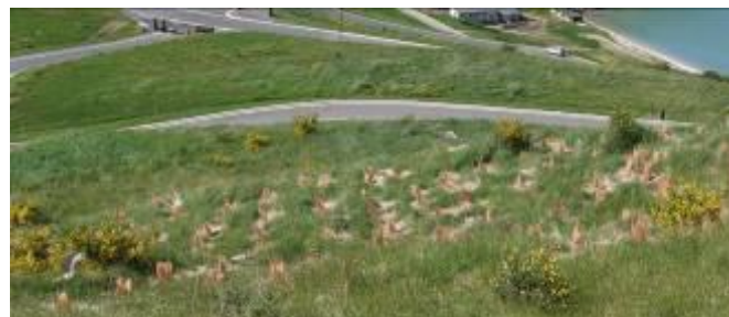
Native revegetation natural area.