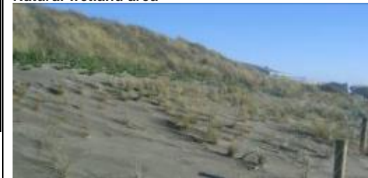
Coastal natural area